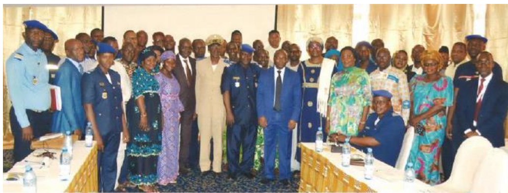
Participants during the PDNA and DRF training in Bamako, Mali in October 2019.

A training on PDNA and DRF approaches took place in Bamako, Mali from 2 to 4 October 2019. The training was delivered to 38 participants representing different sectors including civil protection, health, education, transportation, water facilities, the environment, agriculture, statistical analysis, urban development, and civil society. The training's main objective was to familiarize the participants with PDNA and DRF methodologies and concepts such as the economic impact of disasters, how to design a DRF framework and recovery strategy, and the contingency planning process.