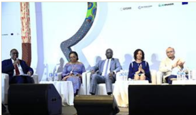
UR West and Central Africa High level plenary on youth and digital skills.

The event included 10 workshops, 10 ignite presentations, 4 plenaries, 20 technical sessions, 3 side events, 3 high level site visits and 2 social events. Approximately 130 speakers participated in the conference, of which 30 percent were women and 60 percent were from the West and Central Africa region. Some of the highlights of the sessions included: