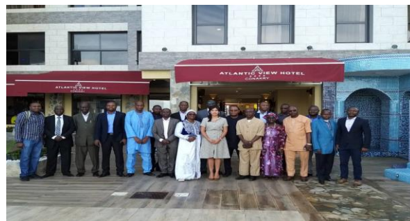
(Left) Opening of the 13th meeting of the directors of national hydrological and meteorological services in Monrovia. (Right) Expert meeting on ECOWAS flood management strategy in Conakry.

As part of the support provided to member states, ECOWAS organized a training on emergency preparedness and response in Cotonou, Benin on 20-22 November 2019. The training focused on strengthening the operational capacity of various actors for prevention, preparedness and response to emergencies and helped with the update of the national contingency plans. The training was attended by 50 participants, including 7 women.