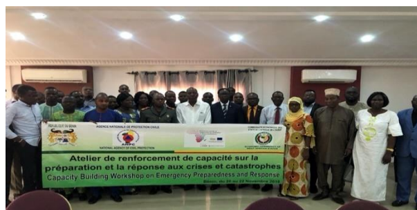
Opening of the disaster preparedness training in Cotonou, Benin.

As part of the support provided to member states, ECOWAS organized a training on emergency preparedness and response in Cotonou, Benin on 20-22 November 2019. The training focused on strengthening the operational capacity of various actors for prevention, preparedness and response to emergencies and helped with the update of the national contingency plans. The training was attended by 50 participants, including 7 women.