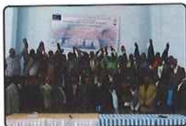
Commitment to uphold the CBO network