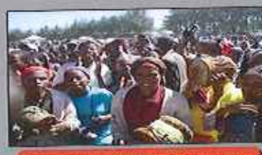
Community members at celebration