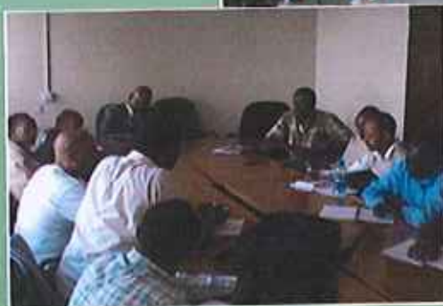
Experience sharing visit to Oromia Region BoFED