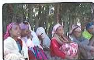
CBO members discussing their project