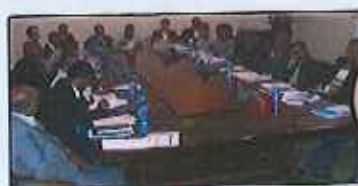
On Urban Poverty in Addis Ababa