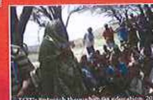
TOT's outreach through mass education, 2011

❖ Awareness and sensitization workshops have been conducted for regional and woreda level women affairs office, NGO representatives, business men and women, religious leaders and community elders