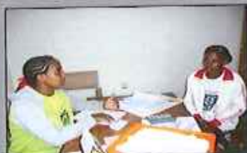
Provision of legal aid