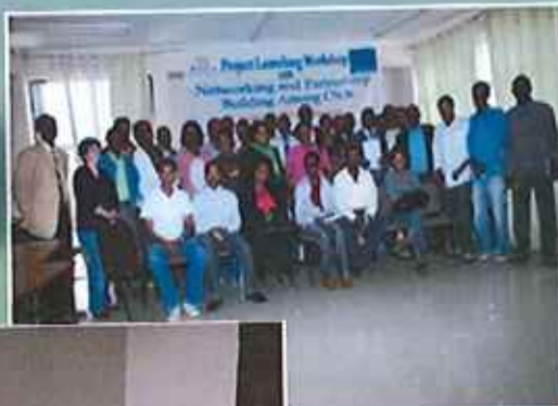
Participants at Project Inception and Induction Meeting

Advance active and effective participation of CSOs in SNNPR's development