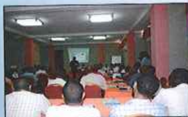
Dialogue Forum between CBIs and Government Officials on CBIs' Issues