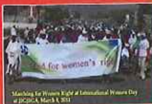
Marching for Women's Right at International Women Day at JICA, March 8, 2011

To contribute to the goal of ending all forms of discrimination against women and thereby foster a socio-economic and political environment that ensures equal participation of women in Ethiopia's Somali Regional State