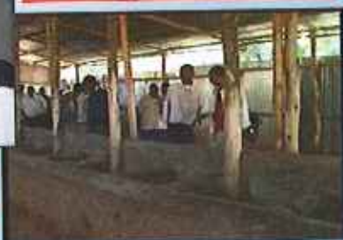
Exposure visit to CBIs' Income Generating Activities (IGAs): Dairy Farm