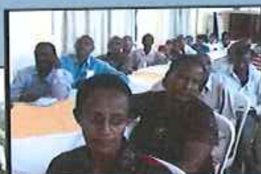
Exposure Visit to CBIs' IGAs: Gardening