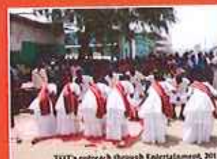
TOT's outreach through Entertainment, 2011

❖ More than 16,000 individuals have been reached through our TOT's community outreach program