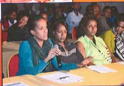
Public Dialogue Forums