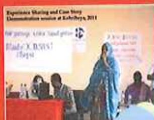
Experiences Sharing and Case Story Demonstration session at Kofuhera, 2011

❖ The first legal women's forum at the regional level entitled "Renaissance Hope Somali Women" has been established