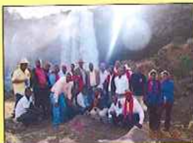
Experience sharing at Amhara Development Association

Advance active participation of Development Associations and civil society actors in SNNPR