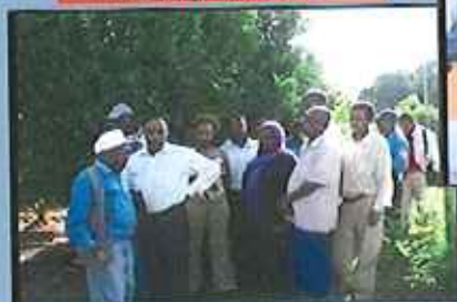
Capacity building training for CBIs