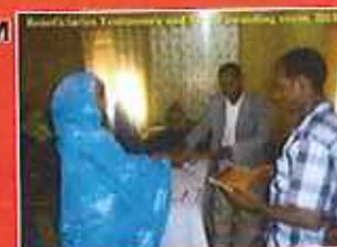
Beneficiaries' Testimonials and Counseling session, 2011

❖ 5 FGM practitioners stopped their work and vowed to teach their community about the consequences of FGM