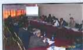
On Social Accountability under Protection of Basic Services