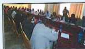
On Donor Support to Ethiopian CSOs