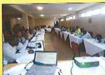
Leadership & sustainable development training