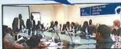
The 1 st Tripartite Dialogue Workshop