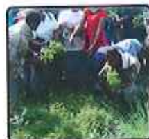
Community tree plantation