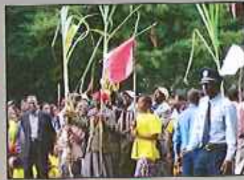
Celebrating "Whole Body Healthy Life" - Freedom from FGM