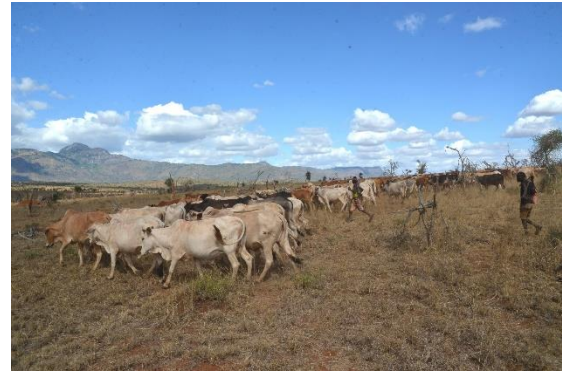
Cattle grazing in LUMO conservation area in Taita Taveta County in Kenya front of the humid highlands of Taita Hills.

The project aims to contribute to the pastoralist households' transition towards climate-smart agropastoral systems in sub-Saharan Africa (Ethiopia and Kenya) by understanding the dynamics of and interlinkages between tropical upland forest cover and semi-arid lowland landscapes, and the multifunctionality of agropastoral landscapes, through a system-wide view of food and nutrition security, diversified livelihoods and ecosystem sustainability leading to improvements.