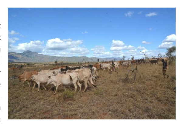
Cattle grazing in LUMO conservation area in Taita Taveta County in Kenya front of the humid highlands of Taita Hills. Photograph credits: Petri Pellikka, 2018.

The project aims to contribute to the pastoralist households' transition towards climate-smart agropastoral systems in sub-Saharan Africa (Ethiopia and Kenya) by understanding the dynamics of and interlinkages between tropical upland forest cover and semi-arid lowland landscapes, and the multifunctionality of agropastoral landscapes, through a system-wide view of food and nutrition security, diversified livelihoods and ecosystem sustainability leading to improvements.