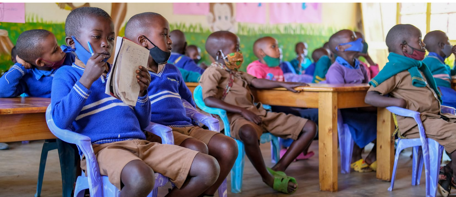
Providing educational activities continues through the Covid-19 pandemic – also thanks to volunteer projects implemented by Ambrella members.

International volunteers currently play a significant role in society – among other things – in slowing down radicalisation in relation to the phenomenon of migration. 43,44 And it is sending organisations that can facilitate critical debate and worldview formation of volunteers in the final phase of volunteering cycles – in the context of post-arrival/return awareness-raising activities and education for global citizenship. At the same time, they influence educational and development activities through their relational approach. Thus, the completed volunteer placement (and the whole project and programme) contributes not only to the mind-shift of the individuals, but also to improving the resilience of the whole communities involved. 45