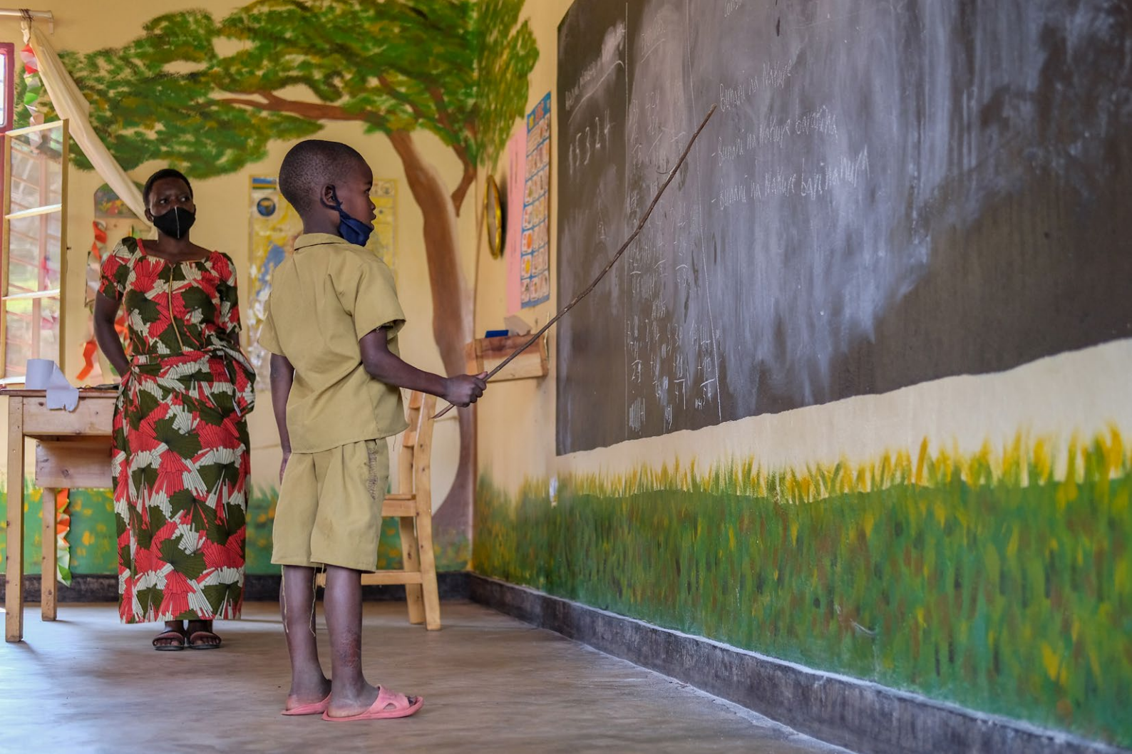
Volunteering in Rwanda: an educational project of Caritas Slovakia in Kibeho.

towards the implementation of the Global Goals. 8 It also covers the field of ODA, including its international volunteering programme.