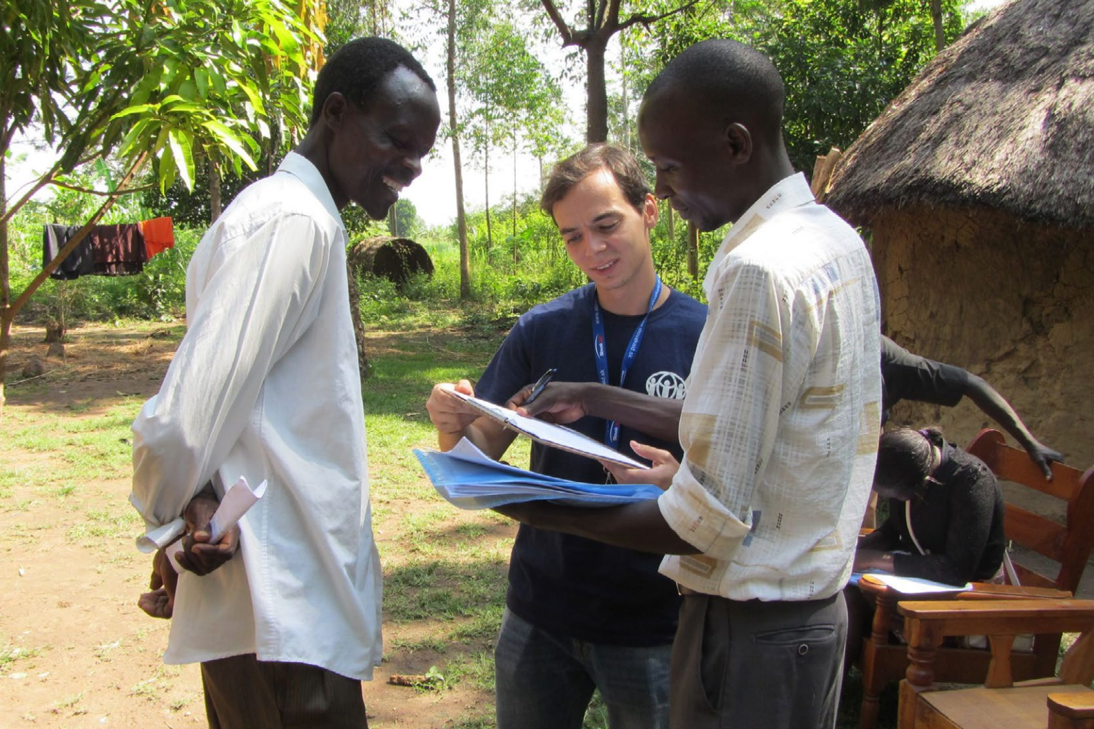
Volunteering in Kenya: working with farmers on sesame seeds distribution. Photo: ADRA Slovakia archive, 2016.