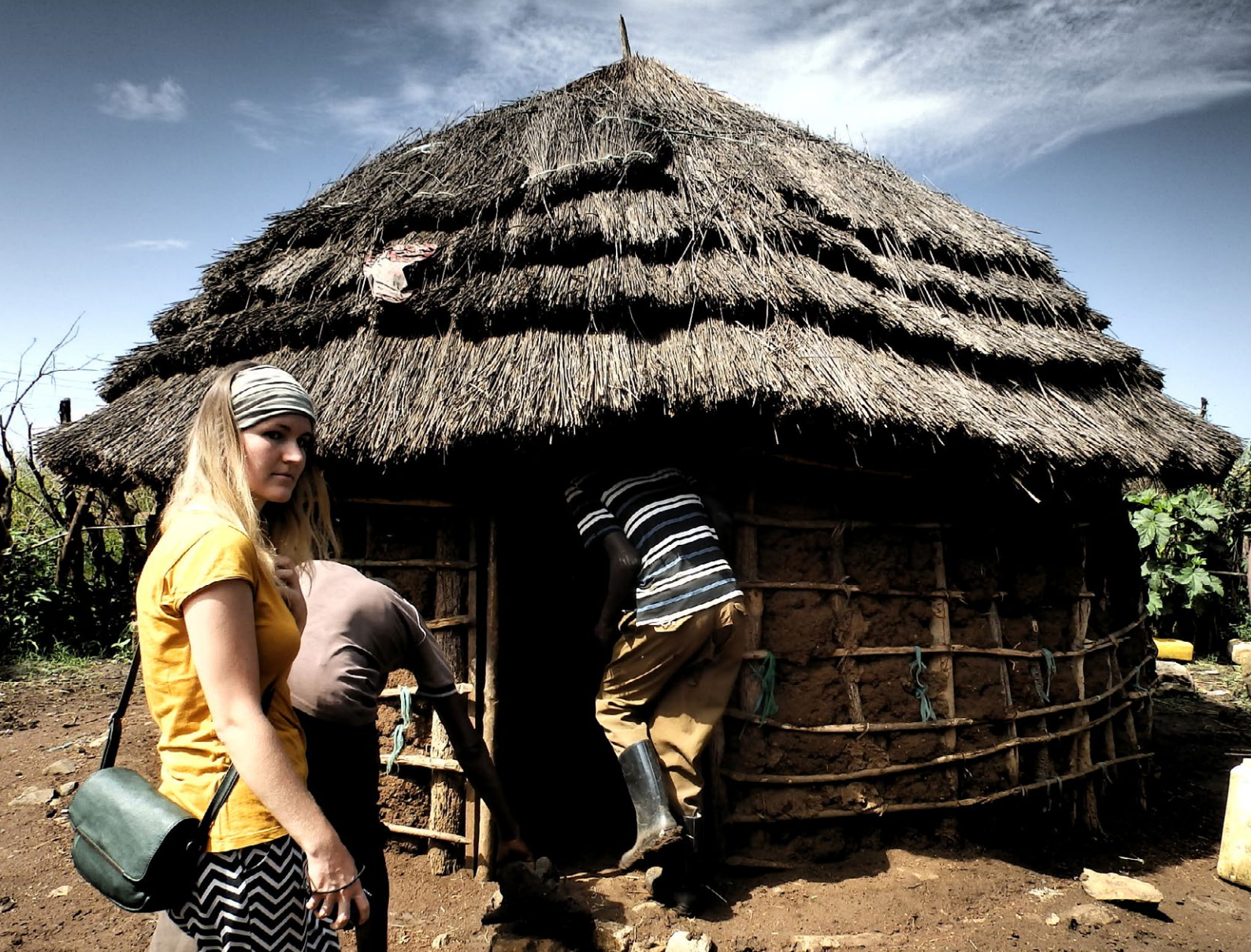
Volunteering in Uganda: monitoring of HIV clinic clients in Buikwe. Photo: Marek Čulaga and eRko, 2017.