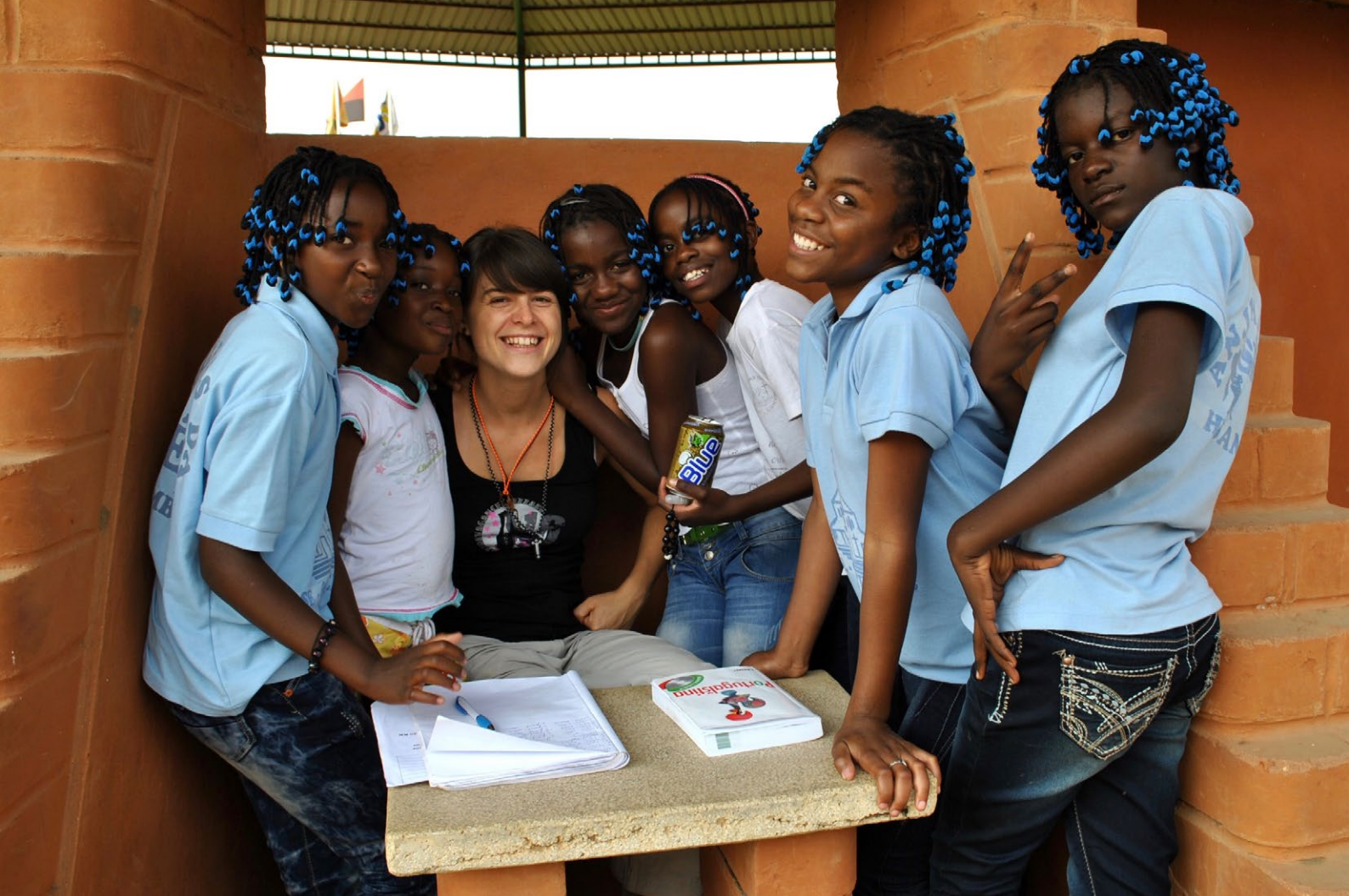
Volunteering in Angola: supporting new skills development of vulnerable children.

volunteer cycles under the SlovakAid brand abroad were identified and analysed, what it all entails and how they benefit from it. Selected findings are presented in the following subsections.