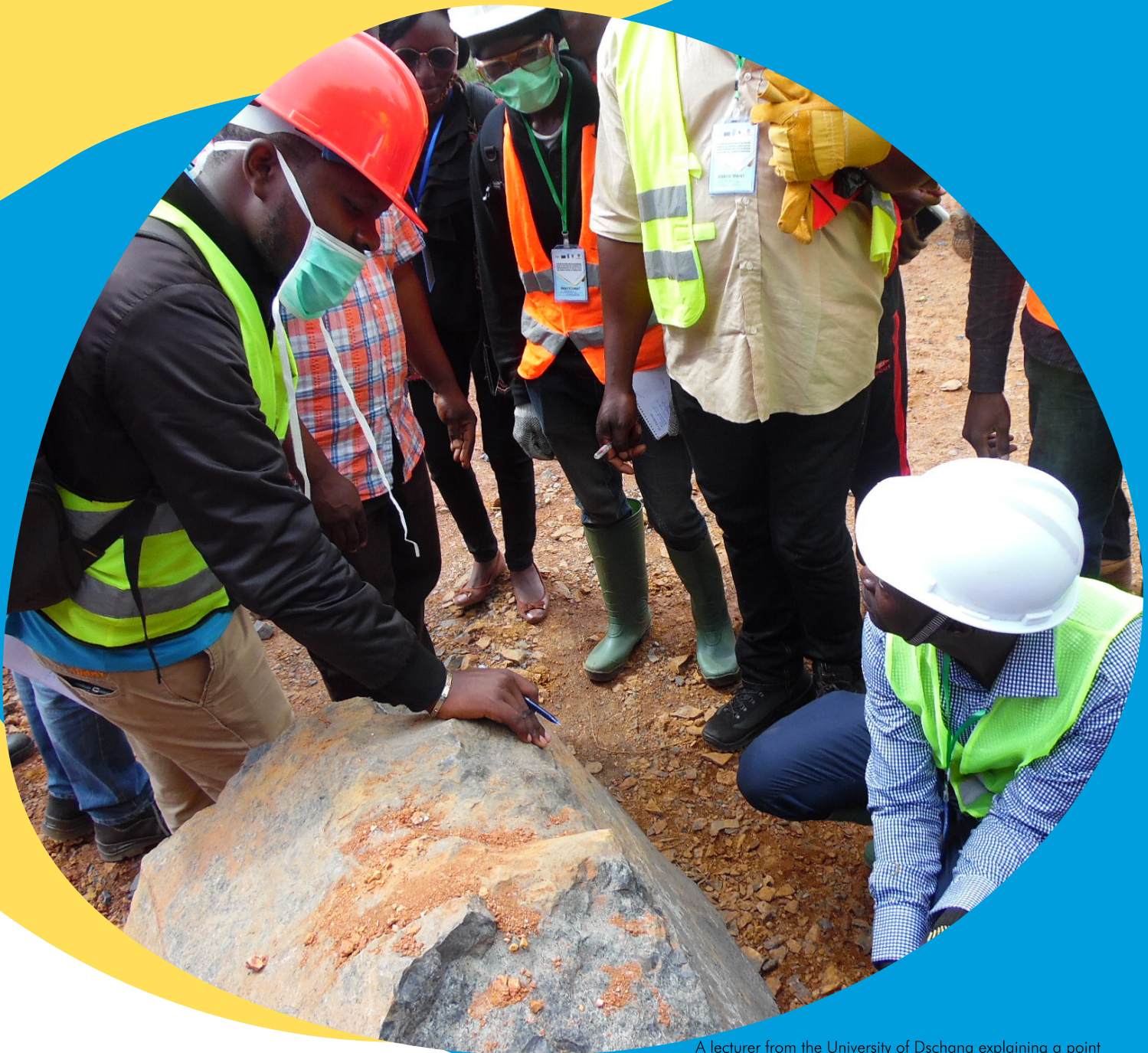
A lecturer from the University of Dschang explaining a point to students on a field trip