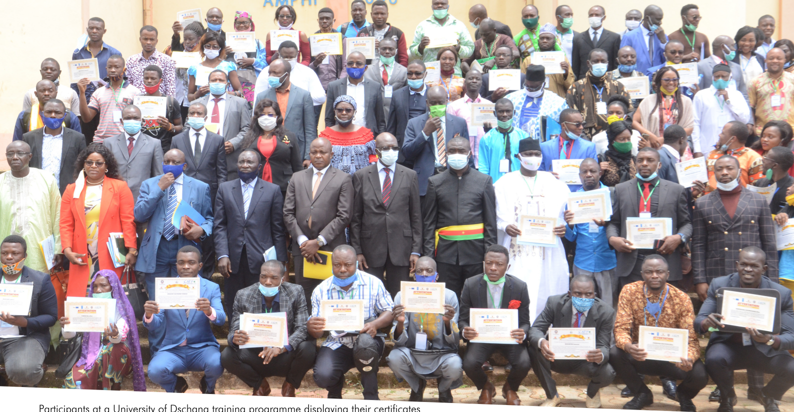
Participants at a University of Dschang training programme displaying their certificates