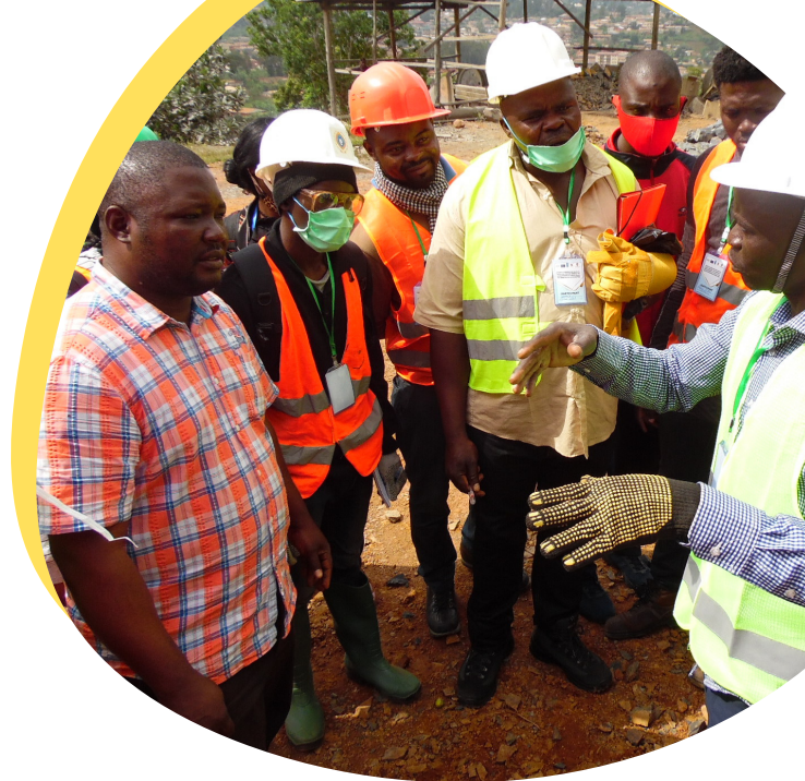
Students of the University of Dschang interacting with their lecturers during field trip

295 artisanal miners received extension services and artisanal mining cards in Central, Southern and Eastern regions of Cameroon, completing essential steps toward formalization