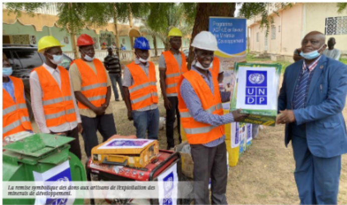
La remise symbolique des dons aux artisans de l'exploitation des minerais de développement.

Ils ont reçu vendredi 16 juillet 2021 dernier à travers le MINIMIDT un don en matériels devant les aider à améliorer les conditions de travail sur le terrain.