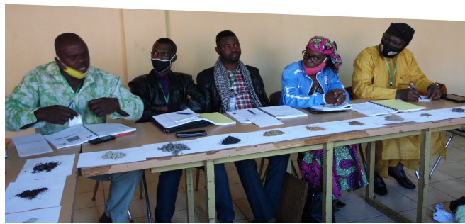
Training in value addition for ASMEs