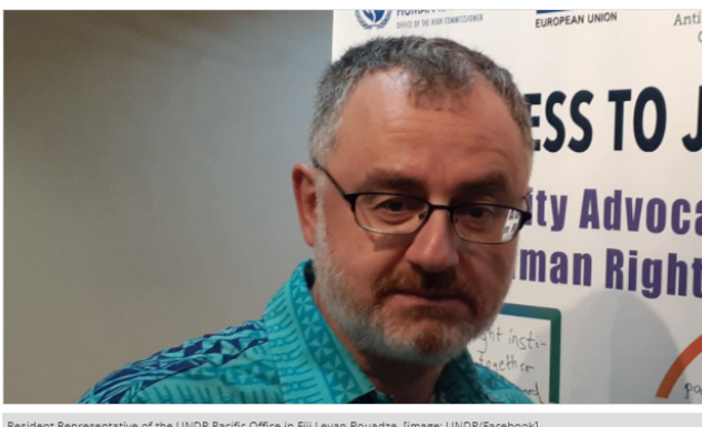
Resident Representative of the UNDP Pacific Office in Fiji Levan Bouadze.

Traditional salt and pottery makers operating Micro, Small and Medium Enterprises have benefitted from a grant that will ensure the continuation of their businesses during this COVID-19 pandemic period.