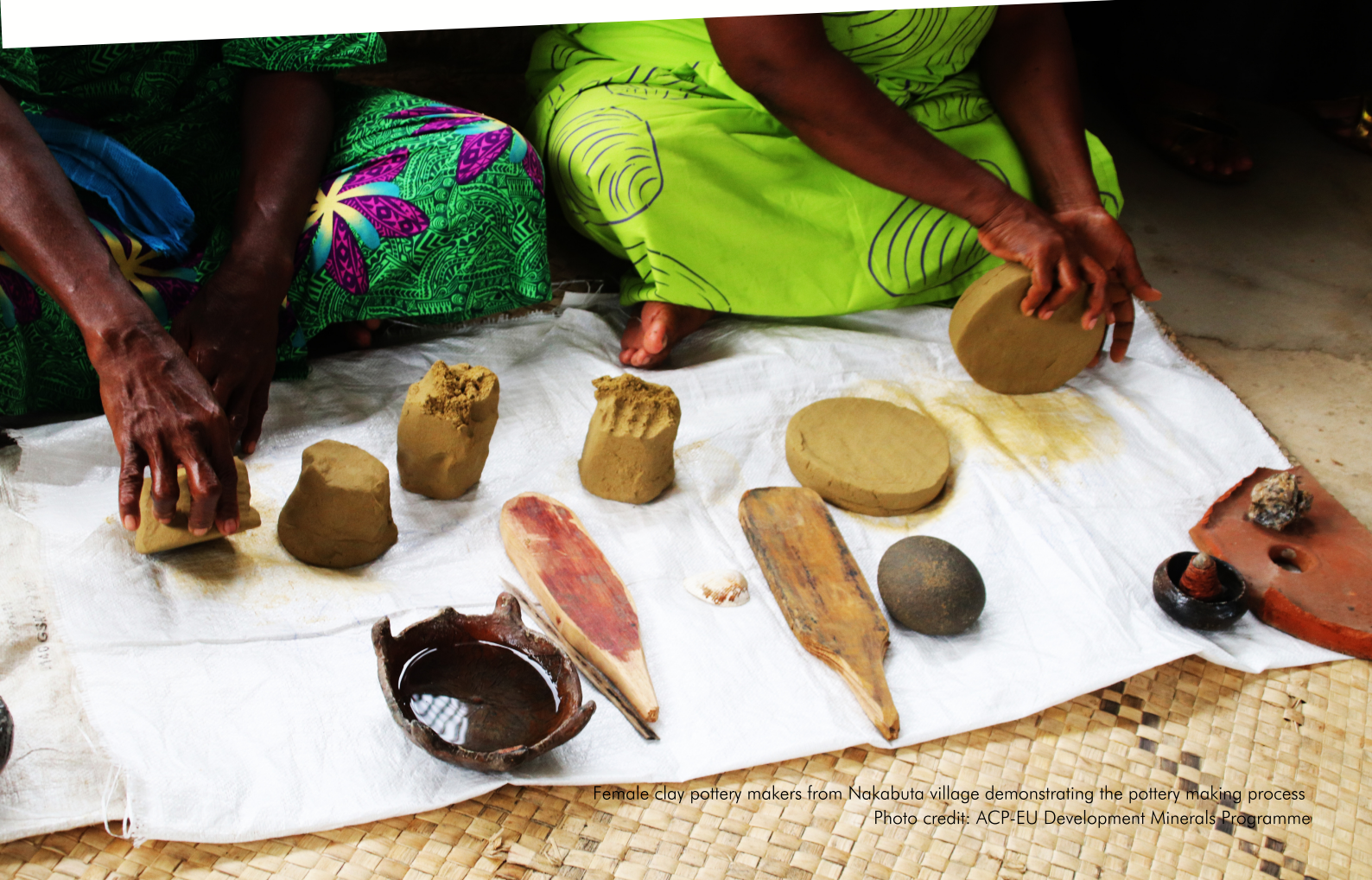
Female clay pottery makers from Nakabuta village demonstrating the pottery making process