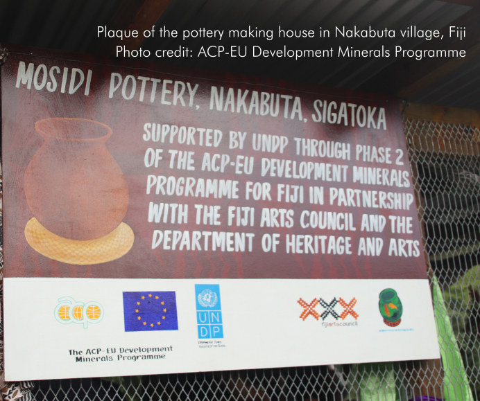
Plaque of the pottery making house in Nakabuta village, Fiji