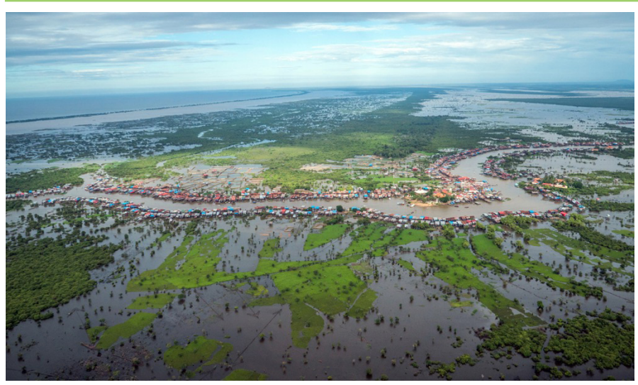
Flooding in Cambodia, Kompong Khleang village

EU GCCA+ programmes contribute to mobilisation of public and private domestic funding for climate action, and development of specific domestic mechanisms for climate funding (trust funds, grant schemes, insurance schemes). Support is also directed to developing financial incentives to promote the use of low-carbon technologies or financial framework for Nationally Determined Contributions (NDC) implementation.