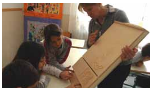
Demonstration of bat boxes

Under the lead of the Secretariat of the Convention on Migratory Species (CMS), the Year of the Bat (YoB) campaign reached out to a global audience. A joint campaign by CMS and EUROBATs has been encouraging governments, civil society and interested individuals to participate and engage in educational awareness and conservation work.