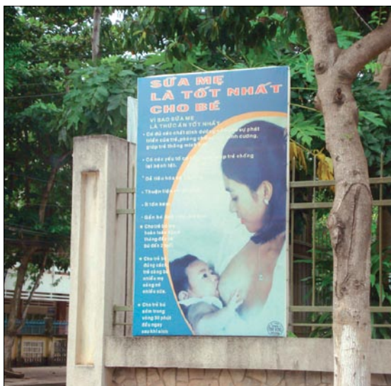
Breastfeeding campaign billboard in Viet Nam.