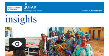
International Fund for Agricultural Development Bringing financial services closer to rural populations in Sierra Leone (2019)

Description: overview of the findings from GEF's periodic comprehensive evaluation. It includes background, context, key findings, and recommendations. Length: 4 pages Cost: Produced in-house Production time: Produced in-house Produced by: Evaluation task team leader Language: English