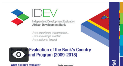
African Development Bank Eswatini: Evaluation of the Bank's country strategy program (2009-2018)

Description: Brief of the evaluation of the EU's cooperation with Myanmar. A user-friendly layout helps to make this document easy to read. Length: 3 pages Cost: €1,500 Production time: 3 days Produced by: graphic designer Language: English