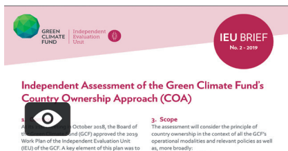
Green Climate Fund Country Ownership Approach (COA)

Description: Well presented key learnings from an evaluation about concessional finance, presenting recommendations, key messages and challenges. Length: 2 pages Cost: $1,000 Production time: 3-5 days Produced by: IED headquarters Language: English