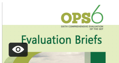
Global Environment Facility IEO BRIEF OPS6: Sixth Comprehensive Evaluation of the GEF

Description: a summary of the GCF's plan to assess its Country Ownership Approach, comprising sections on context, scope, methodology and planned country visits. Length: 2 pages Cost: Produced in-house Production time: Produced in-house Produced by: GCF headquarters Language: English