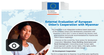
European Union-DG DEVCO External Evaluation of European Union's Cooperation with Myanmar

Description: Brief of the evaluation of the EU's cooperation with Myanmar. A user-friendly layout helps to make this document easy to read. Length: 3 pages Cost: €1,500 Production time: 3 days Produced by: graphic designer Language: English