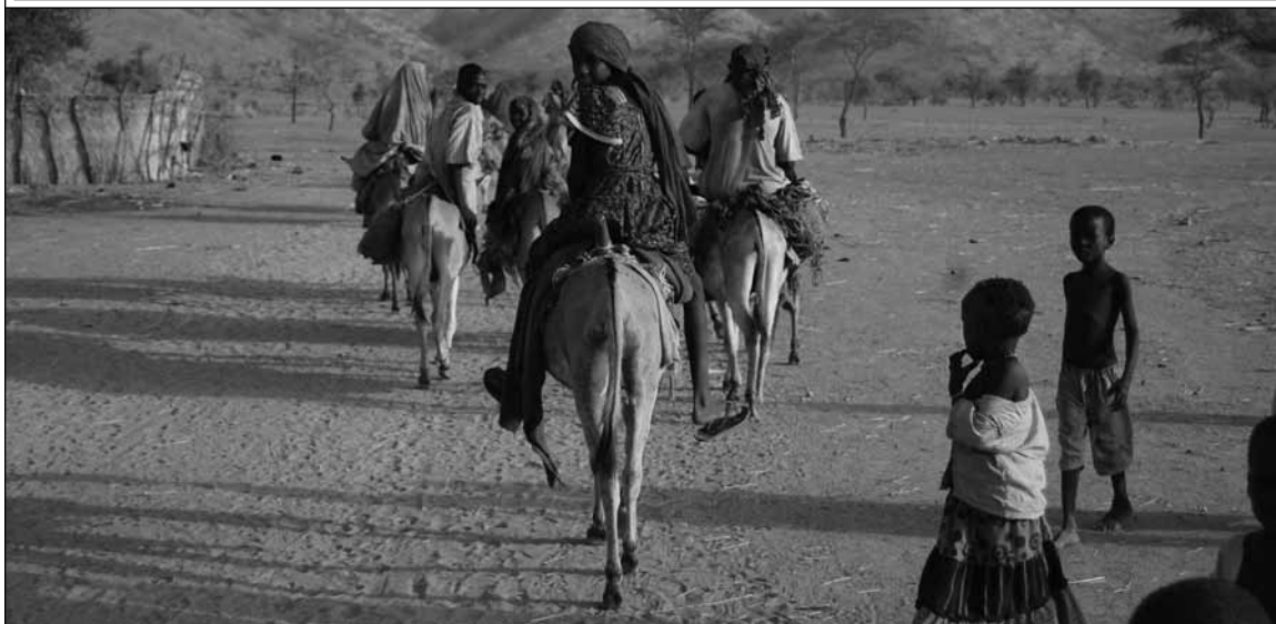
Internally displaced Chadians return from a market near Goz Beida. The vast space and the breakdown of rule-of-law has created ideal conditions for banditry and looting in Chad’s eastern region. (Chad, May 2009.)

Chad’s rebels, however, do not represent the most immediate threat to civilians... The greatest threat to civilians and humanitarian operations is banditry. Bandit groups, which sometimes involve local authorities, the Chadian military, and moonlighting police or gendarmerie, act with almost complete impunity in the eastern part of the country... These bandits are responsible for chronic car-jackings (specifically the theft of 4x4s belonging to humanitarian actors) and the violent looting of humanitarian workers and local civilians throughout the east. The threat becomes particularly acute in the wake of a rebel attack, when bandits capitalize on the chaos and the absence of local authorities.” 22