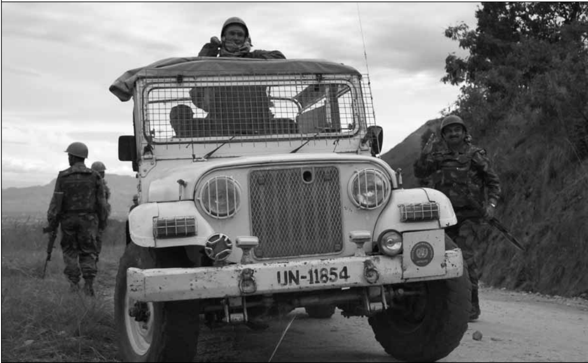
MONUC security escorts help protect UN personnel in the volatile North and South Kivu provinces of DR Congo. (DR Congo, October 2009.)