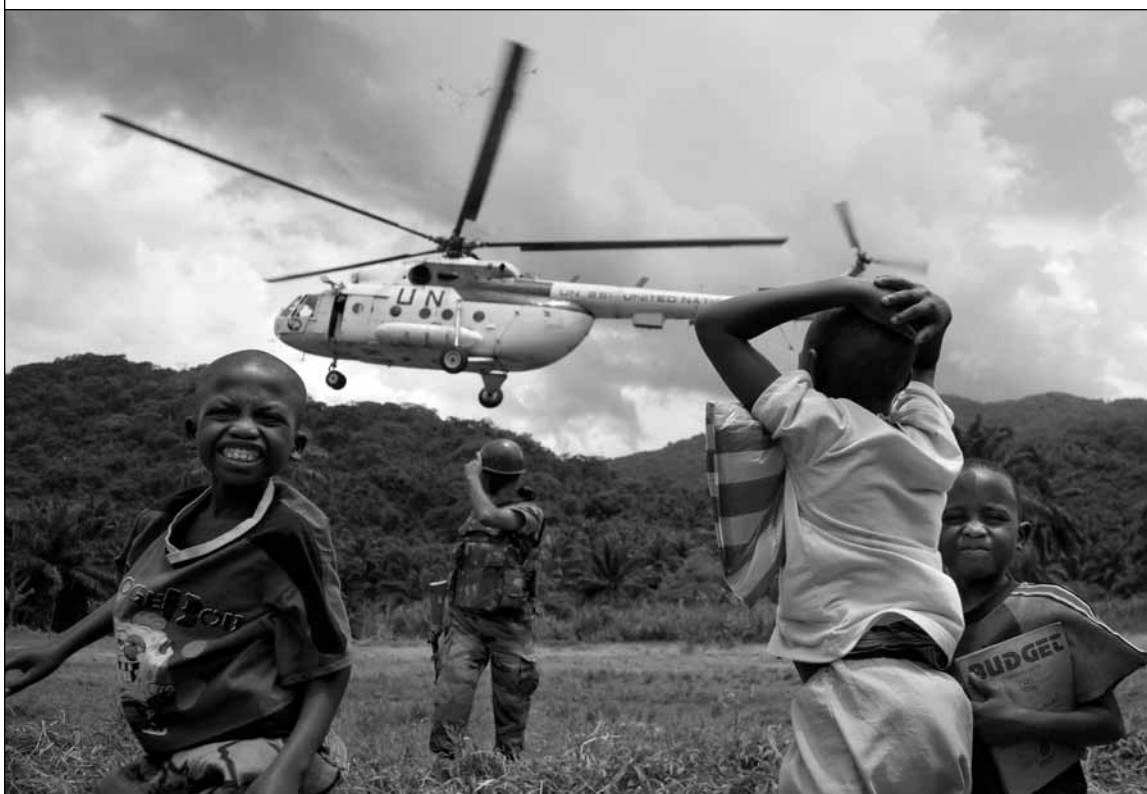
Children from a nearby village in North Kivu province come out to watch a UN helicopter land near the UN peacekeeping base. Many Temporary Operating Bases depend entirely on helicopters to deploy troops and re-supply materials in remote locations like this one. (DR Congo, October 2009.)

Traditional military structures, tasks and training methods were designed to defend territories, not to protect individuals, and this is a critical distinction. Where it might be