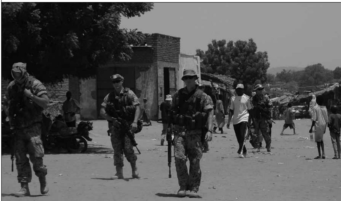
Troops of the UN peacekeeping mission in Chad conduct foot patrols to demonstrate presence and deter attacks against civilians. (Chad, May 2009.)

Accountability of Mission Leadership: Mission leadership needs to be better prepared to assume the complex demands of a protection mandate, particularly in the context of complex, multidimensional peacekeeping operations. As the OCHA/DPKO study states, “Mission leaders...need to be held accountable for the production of mission-wide strategies and for reporting on their results. When leaders do not ask for results, it reduces the ability and chances for missions to achieve their aims.” 32