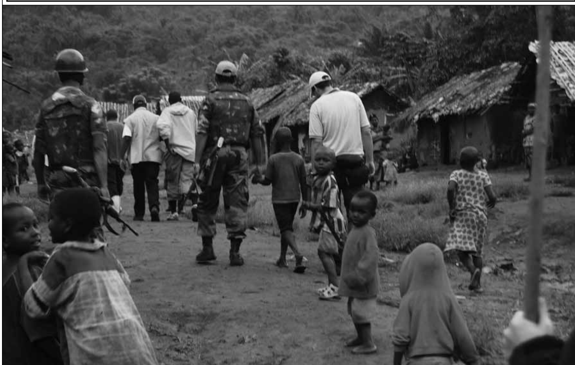
A military UN peacekeeper and the Joint Protection Team leader walk with local children during a daily foot patrol in a village in North Kivu province. The Joint Protection Teams help design local protection plans in case violence erupts. (DR Congo, October 2009.)

“The peacekeepers have built a strong relationship with the local community. In our two days on the base we met numerous community leaders from Ntoto and surrounding villages who had come unsolicited — always on foot, and often from several hours away — to speak with the commander and share news. [We] were told by a local school teacher that over 450 families who had been displaced by violence earlier in the year had returned home as a result of the protection that the MONUC soldiers had provided...” 55