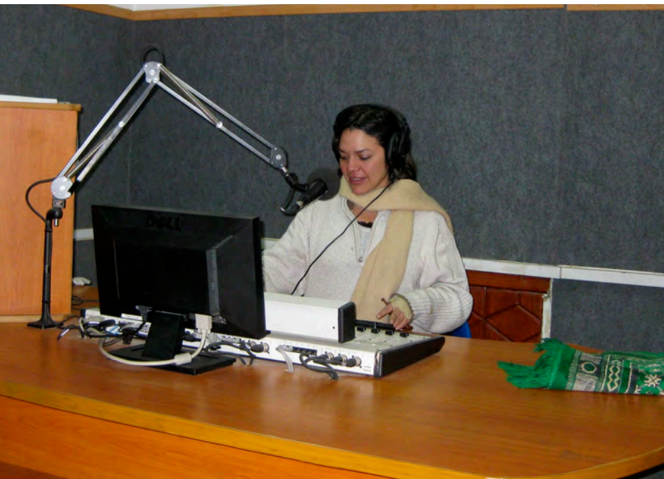
Women in media and ICT can be powerful champions of change, both by serving as role models and by delivering constructive messages to Afghan men and women.

ment Support Agency [AISA], and the Export Promotion Agency of Afghanistan [EPAA]) that liaise with and provide business information to the women's business organizations.