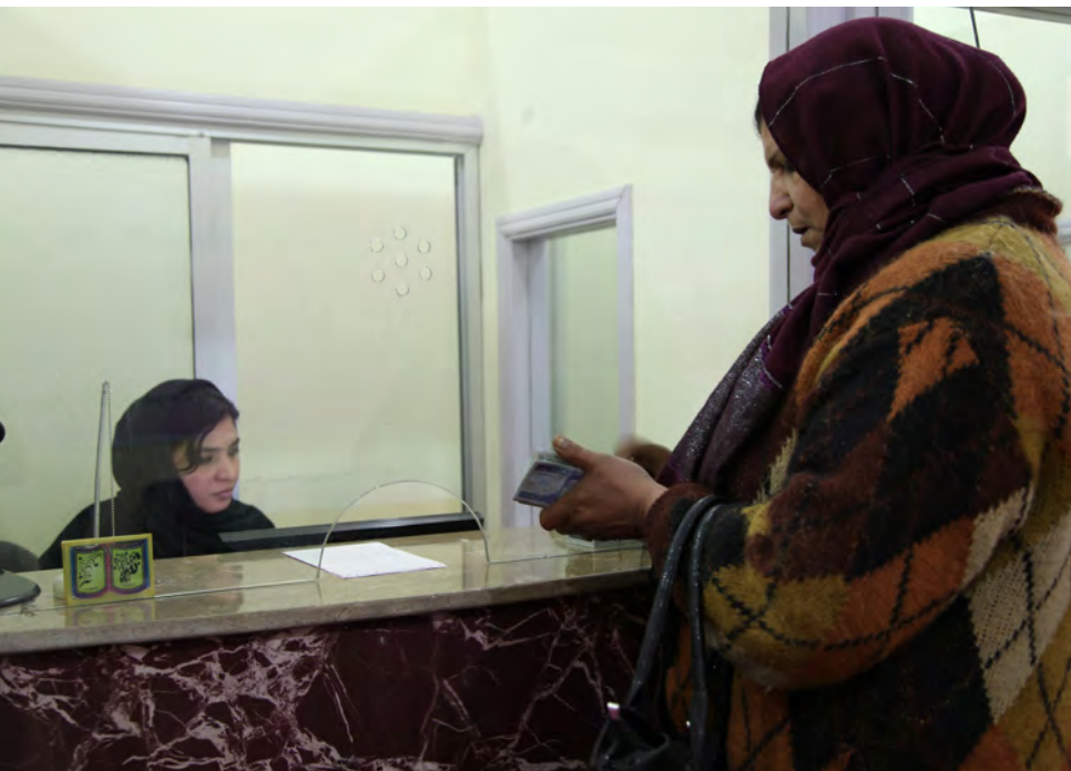
A woman's branch of Maiwand Bank offers a socially safe place for women to retain control of their finances.