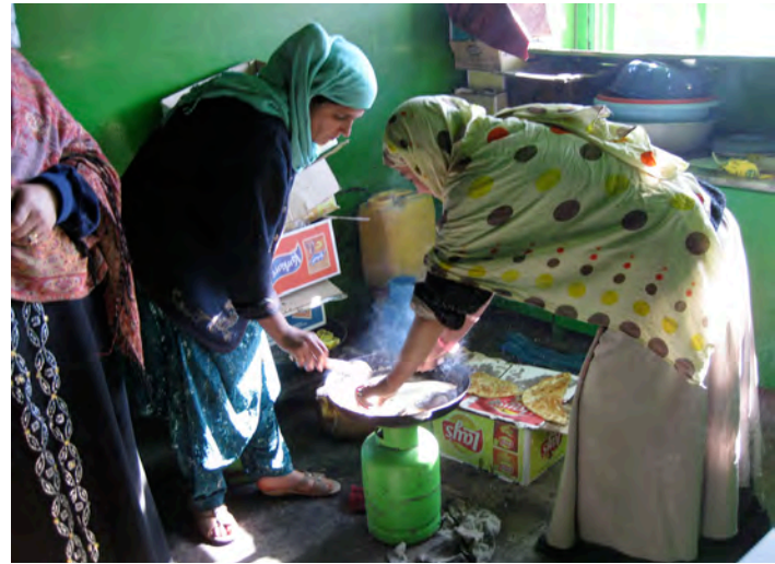
Women make bolani at a woman-owned shop that doubles as a restaurant and small grocery store. Outside of unique venues like the Kabul Women's Garden, female shop owners are rare.

Media, social media, and ICTs can serve as powerful tools to introduce female role