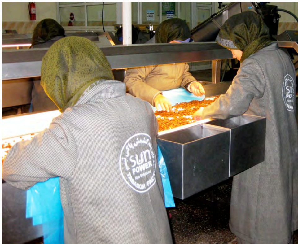
Factories that offer women-only workspaces neutralize some of the key social barriers to female employment.

Most livelihood projects focus women on developing crafts, such as sewing or jewelry making, without addressing skills such as the ability to calculate profit. Women who sell at markets and do not have the numeracy skills to calculate the cost of a product's raw materials and time, for instance, end up selling goods for little profit or, at worst, a loss. Foundational education in numeracy is critical for women's economic empowerment, and literacy is necessary if women are to grow beyond the most simple business interactions. While basic education is outside of the scope of most economic development