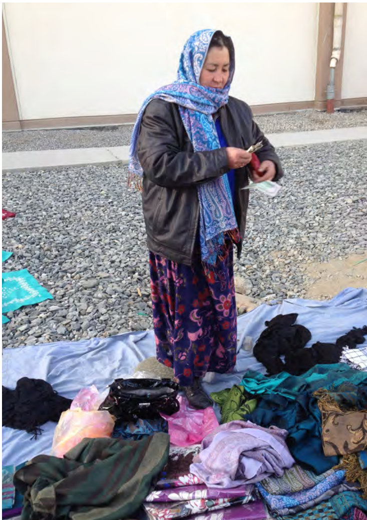
Basic numeracy and financial literacy skills can help women understand profit and earnings.

While some women working at the livelihood level require access to finance in order to purchase inputs for their businesses, many have a greater need for numeracy skills and financial literacy to help them make good financial decisions. As observed in the bazaars, many women do not understand profit margins for pricing goods and some cannot negotiate with customers because they do not know their numbers. Even if they can obtain microfinance loans, their lack of numeracy inhibits them from knowing how to make a profit, understand a business plan, or obtain a loan from the bank. As a result, women who do grow and improve their businesses are often dependent on the male members of their households for assistance and lose control over their own finances.