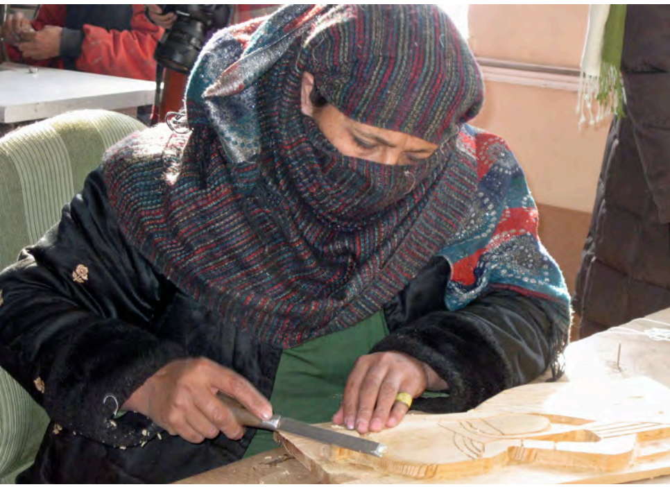
This Afghan woman, employed by a female business owner, has been trained in skills for which there is local market demand.

A palm tree growing in the shade will not bear ripe fruit. Afghan Proverb