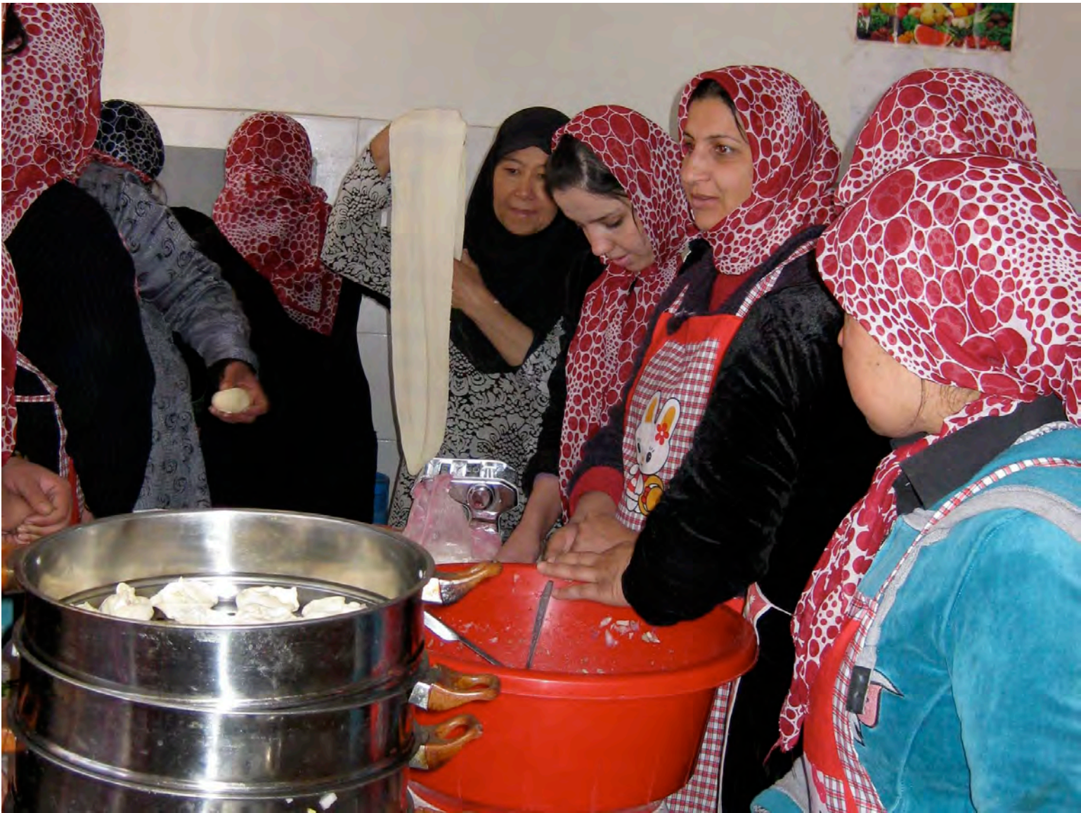
These women, trained in cooking skills, hope to be linked with catering or hotel restaurant work. Training programs that are linked to future income-earning opportunities are key.

clear quality outputs through which women can prove their value as service providers.