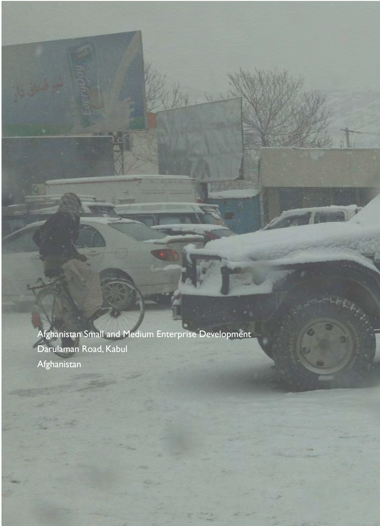
Afghanistan Small and Medium Enterprise Development Darulaman Road, Kabul Afghanistan