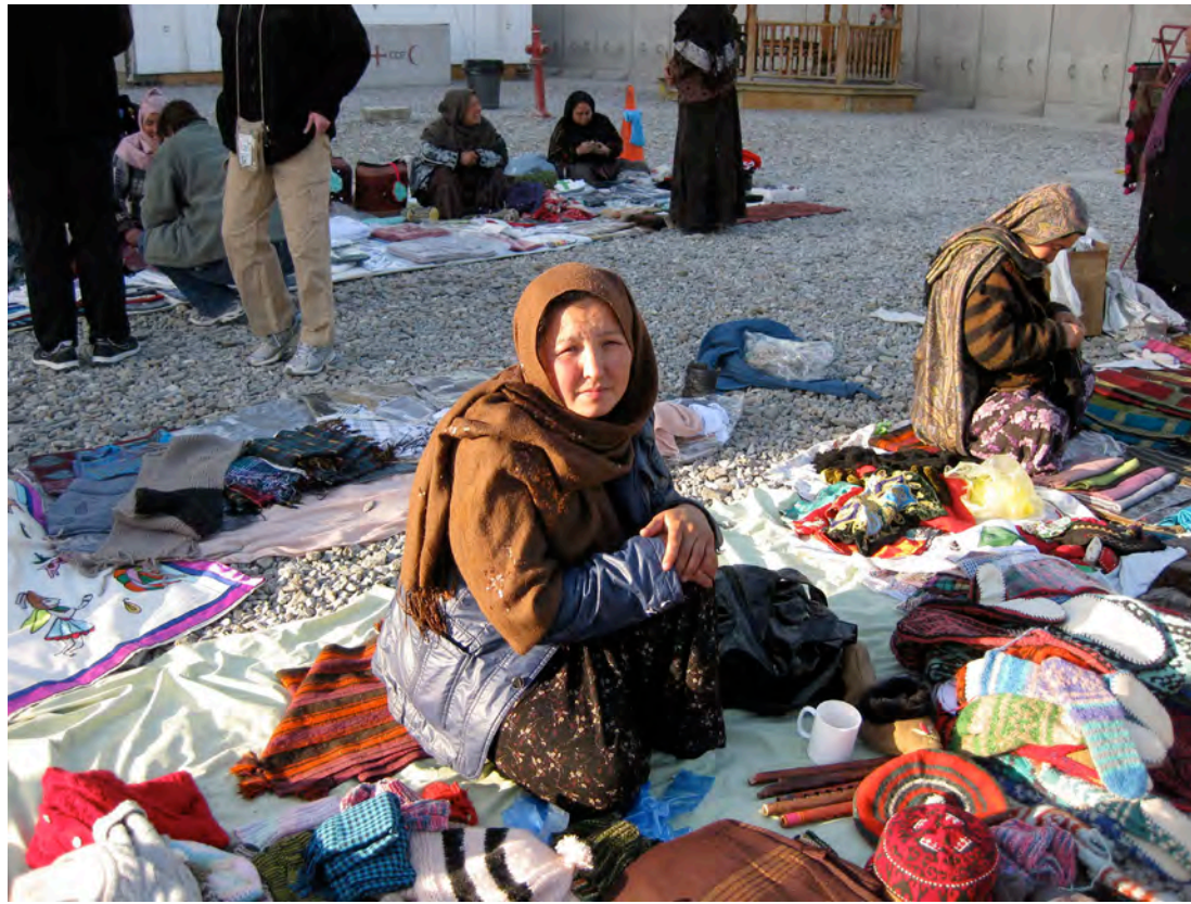
The women's markets held on military bases are among the few places in Kabul that women can act as salespeople. Afghan women at the livelihoods level would benefit from numeracy and literacy training, and more safe sales and production venues.

Unskilled women. Women who lack numeracy and literacy skills have few places to go outside of jobs in sectors or factories that have production lines with primarily women. Most families do not allow their daughters to remain at work once they are married unless there is severe financial need. Stigma attaches to families if the women work. Male family members receive social pressure—they are considered by the community as not being able to care for their women and families. But between university and marriage, there is a window of