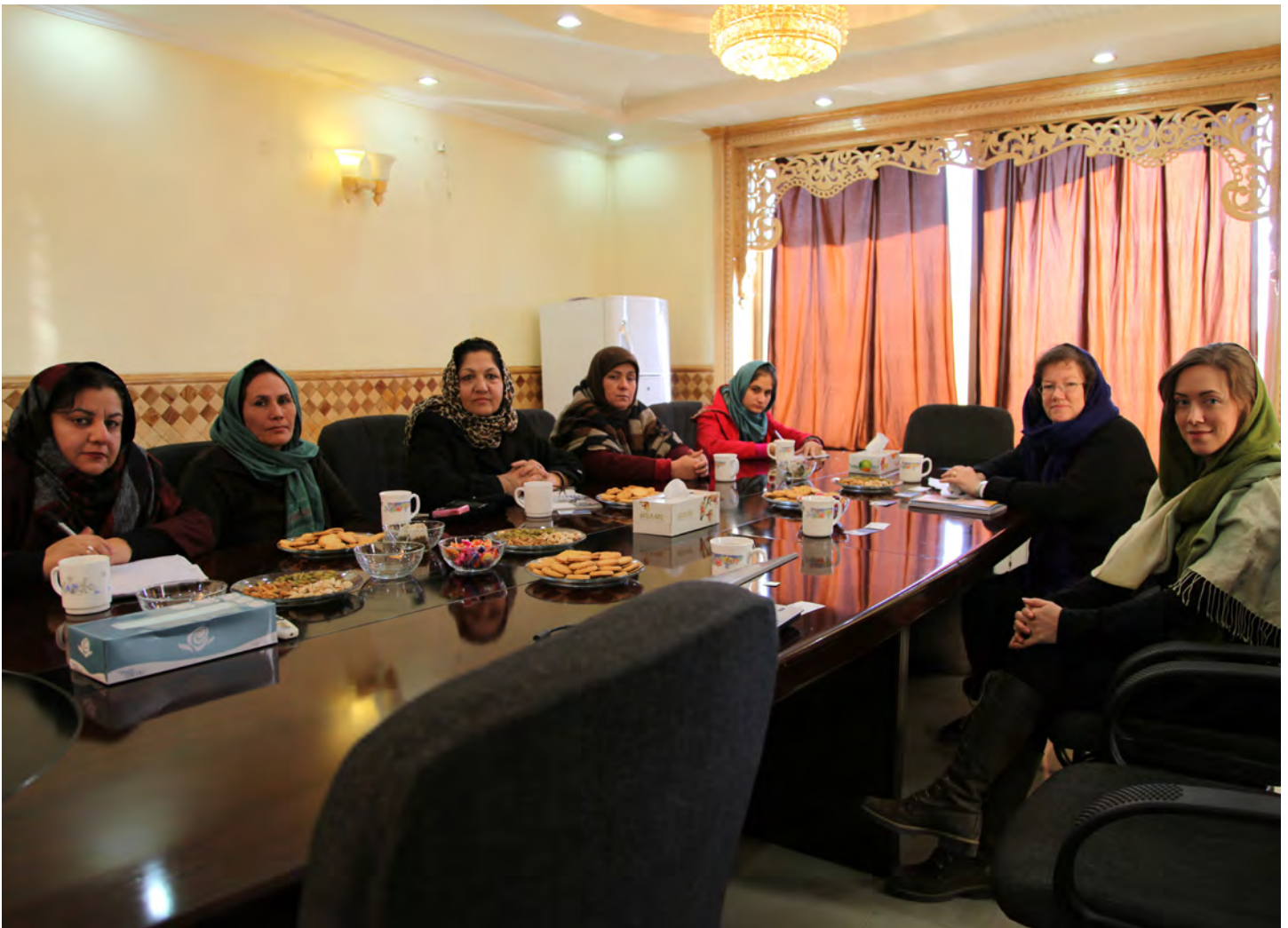
Afghan female business owners are eager to grow their enterprises but lack the necessary skills, venues, and access to markets and finance.

Each section outlines recommendations in that area. Crosscutting themes are integrated with greater detail throughout the report. A quick-reference matrix of all recommendations by area follows.