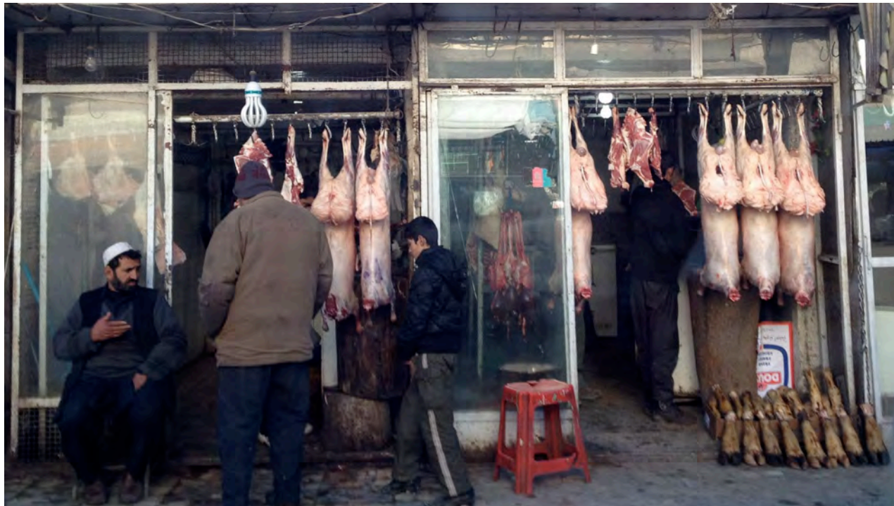
Rows of butcher shops demonstrate the clustered shopping model of Kabul that is dominated by male shopkeepers and owners.

Provide a sales location that fits in with the preferred cluster model of shops for women. Since customers (men and women) are used to “clustered shopping”—going to the street where there are five wedding dress stores in a row, butchers, flower sellers, etc., it is necessary to create a space that conforms to the market demand and preference. The current models only have men as shopkeepers. MOWA and city planners could identify venues in commercial areas that are perceived as safe, are close to transport, and allow women to sell their goods. This concept builds on the Zardozi Model but expands it both physically and to address local market needs. Such a cluster should have all of the best attributes of a shopping area, including parking, toilet facilities, and light. Ideally, the infrastructure costs should be underwritten