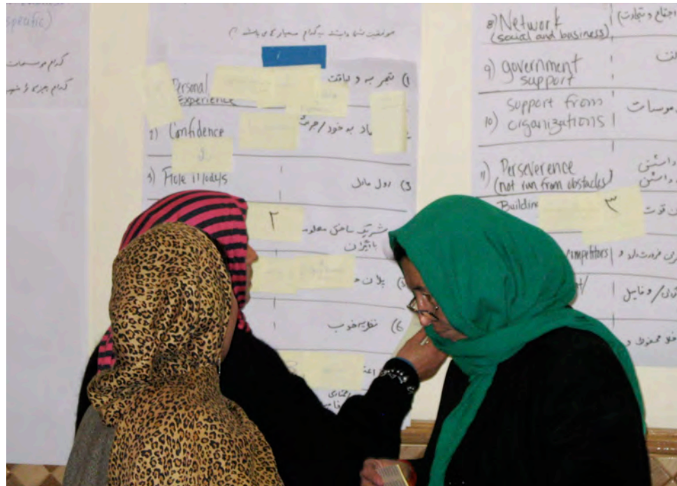
As part of a focus group, female business owners identified and prioritized their key success factors and challenges.

Develop a strategy for economic empowerment that extends to the provinces. It is not surprising that women in the capital and larger urban areas have more economic opportunities than their provincial counterparts; they, their male family members, and society as a whole are exposed to increased commerce and international trade. A strategy is needed to connect the capital to the provinces by extending support for women's economic development and empowerment into the provinces in a holistic manner. A strategy that links business networks, academia, and sectoral support across the country by building up existing associations