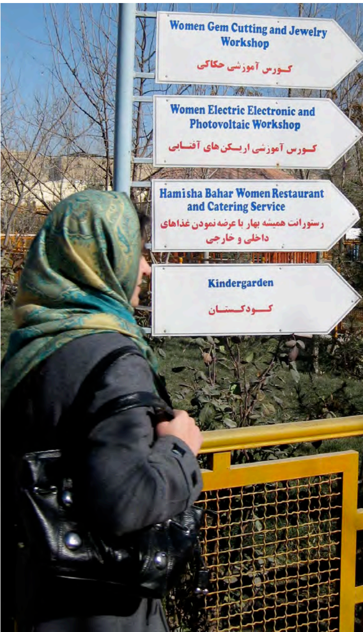
Training and childcare are offered at the Kabul Women's Garden. Afghan women at the livelihoods, employee, and business owner levels would benefit from market-based, comprehensive skills development opportunities.

businesses. Both women seeking employment and female business owners seeking skilled employees would benefit from this information.