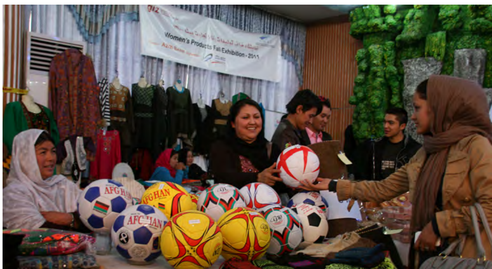
A business owner at the Women’s Products Fall Exhibition, supported by USAID’s ASMED project. Participation in exhibitions allows women to engage in networking and feedback loops, but many women lack the production capacity and business skills to build a repeat customer base.

The business enabling environment that is not referenced in the World Bank’s report is the one that specifically affects women, which is influenced by a number of other social dynamics as discussed in the previous chapter. However, one restriction that affects women