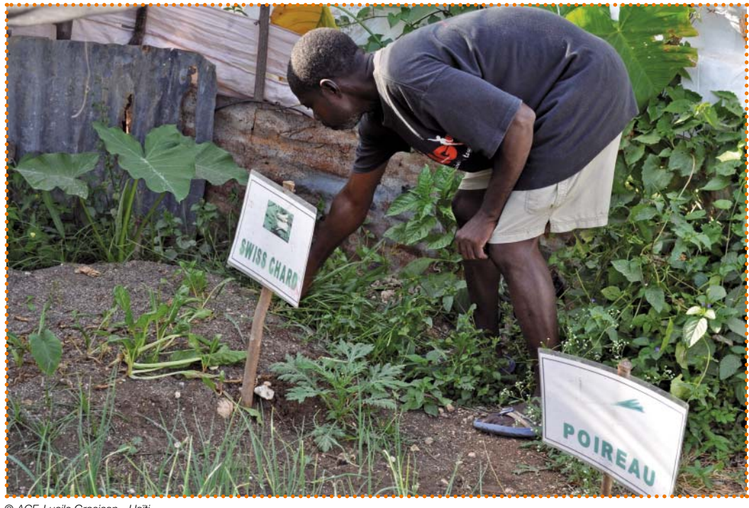
© ACF, Lucile Grosjean - Haïti

This section is based on the interesting level of commonality and similarity that we found across the three case studies, even though the three countries' contexts are very different and we acknowledge that the representativeness and relevance for other countries might be limited.