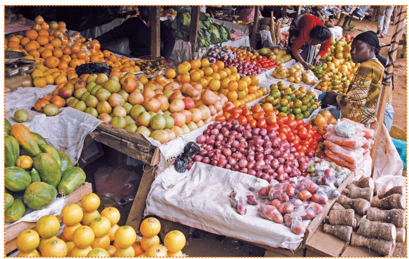
© ACF, Christina Lionnet - Kenya

tion outcomes in Burkina Faso, the Bank did not integrate nutrition indicators into the programme design and was therefore unable to monitor the nutritional impact of the programmes. The focus of all the five World Bank programmes currently running in Burkina Faso remains on income generation and food availability (which can contribute to energy needs but is not sufficient to fulfil nutritional needs), even for a smallholder farmers focused programme.