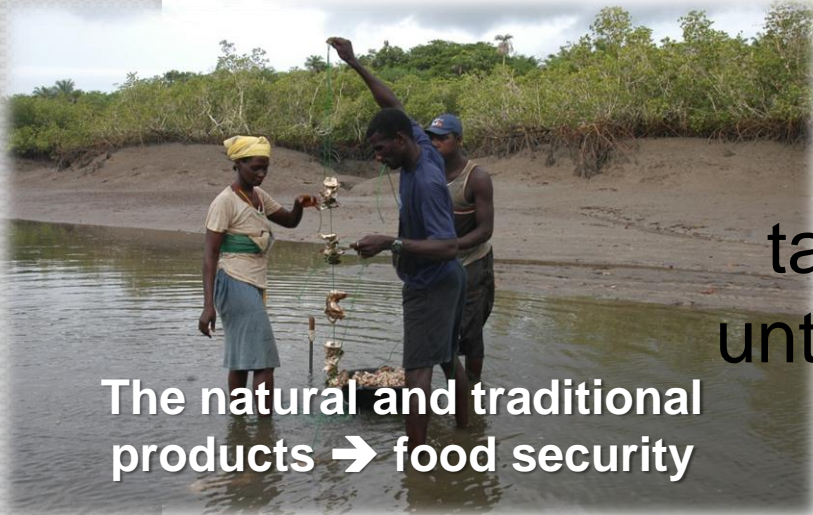
The natural and traditional products → food security