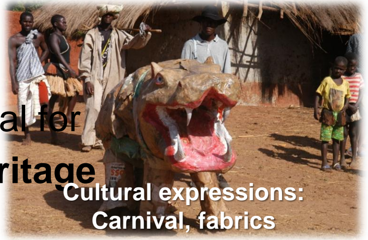
Cultural expressions: Carnival, fabrics