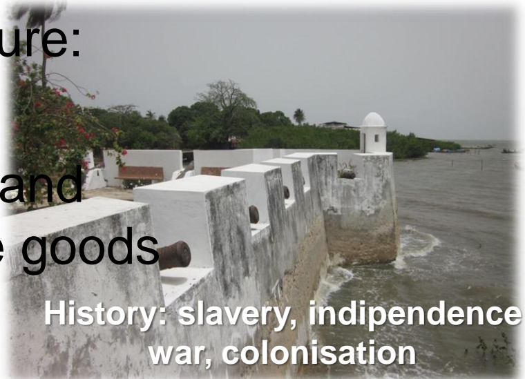
History: slavery, indipendence war, colonisation