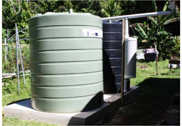
Manufacturing and supplying 5,000 litre water tanks to households throughout the island – climate change adaptation in Niue.