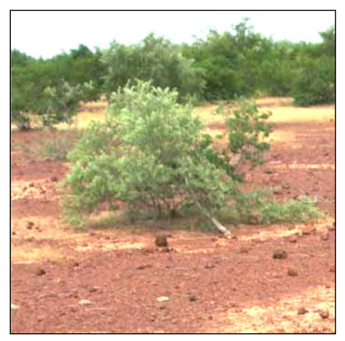
Figure 2. Laterite plateau in Segou town, Mali (UNEP, 2012).

Vegetation in bush fallows (Bielders et al., 2002) and valley sites (Visser et al., 2005b) adjacent to crop fields trap the saltation materials. With a balance between the fallow area and cultivated fields, saltation may result in local redistribution of nutrients and soil particles which remains