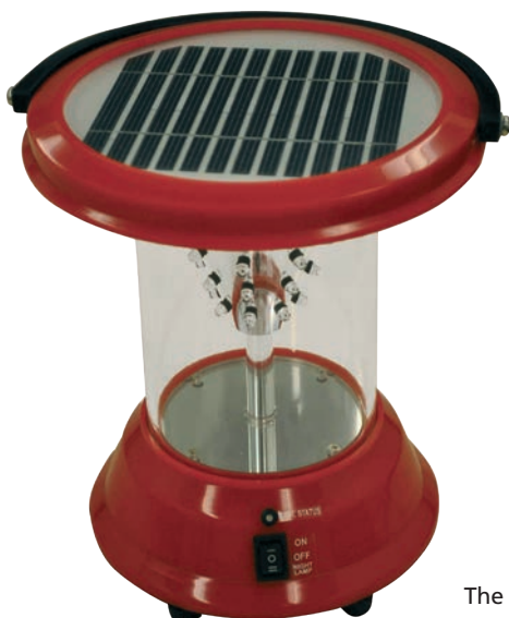
The Solar Lantern: US$39