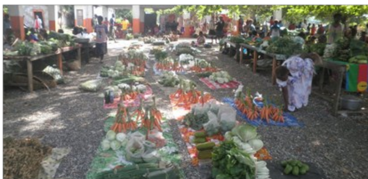
Below: The "fruits" of the Napil Rural Training Centre at the Lenakel Market.