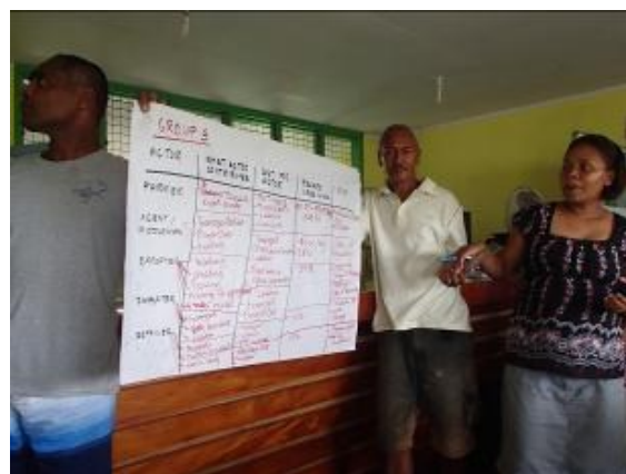
Taveuni Taro stakeholders present results of their group exercise looking at each ‘actors’ role in the chain.

TRTC aims to translate and incorporate some of the value chain training materials into the regular curriculum of the Young Farmers Course.