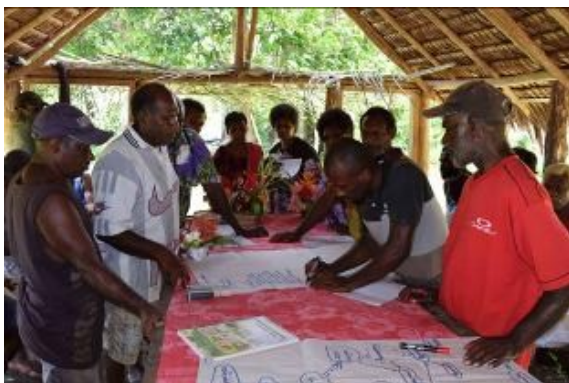
VC Training participants discuss scenarios relating to their pepper farms.

The training focused on the quality requirements and costs of supply of this remunerative, but highly demanding, value added market. This training was exceptionally well received by the participating farmers, an immediate response being realised in terms of the quantity and quality of the pepper being supplied. FSA and Spices Network are now planning to conduct similar value chain trainings for vanilla farmers on Tanna early in the New Year.