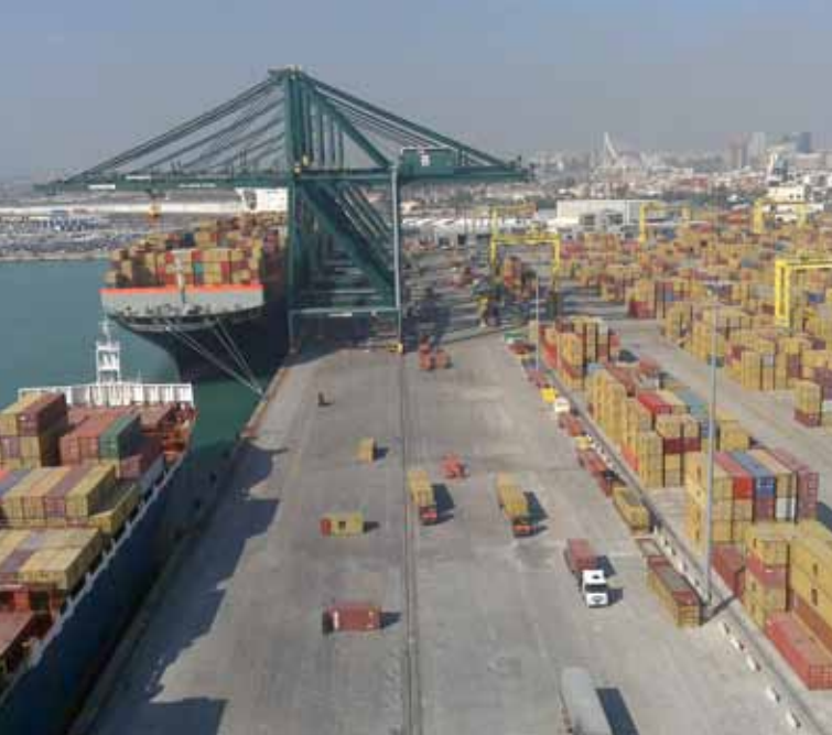
Valencia Port Spain. FLEGT VPA licenses are checked by customs at EU port of arrival. Timber with a valid license is considered legal under EUTR.

IMM will progressively widen the scope of monitoring against the indicators in liaison with VPA countries and other stakeholders as more licensed timber becomes available, market awareness rises, and market monitoring capacity is established.