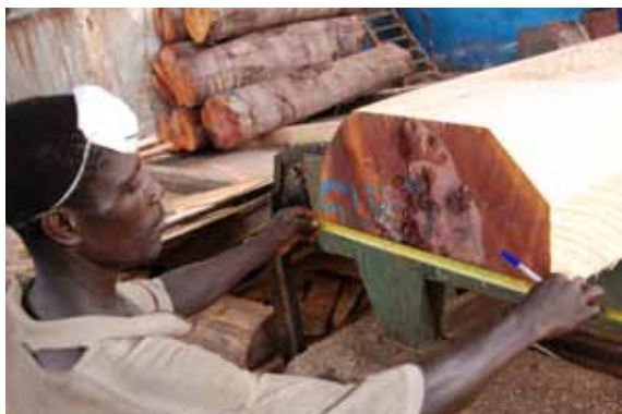
Timber measurement at a sawmill in Ghana - improving the quality of data at every stage of the supply chain is a key part of the FLEGT VPA process.

ITTO has appointed a Lead Consultant based in Europe to develop work plans and co-ordinate data collection and analysis. ITTO is expanding its statistical and data analysis capacity, hosted in Japan, to align with the objectives of the IMM. Building on ITTO's existing network in tropical timber trading countries, IMM is establishing correspondents in each VPA partner country and in priority EU markets for VPA licensed timber. Correspondents are responsible for regular data collection and assessment of market conditions and product prices.