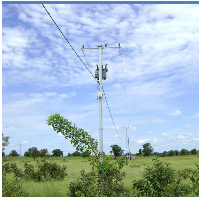
Benin Burkina Faso WAPP 9 ACP RPR 49-39

Following the Call for Proposals launched in 2009 that allowed providing grants for additional 68 Energy Facility projects (bringing the total of EF projects up to 140!), a new Call for proposals is expected to be launched in October 2012. You will find in this newsletter some preliminary information about this Call.