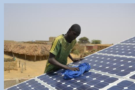
Mauritania 9 ACP RPR 49-30 - PERUB

The long-term overall objective of the ACP-EU Energy Facility is to contribute to the achievement of the Millennium Development Goals (MDG) on poverty alleviation, as well as of the World Summit on Sustainable Development (WSSD) objectives on energy, while helping to fight against climate change.