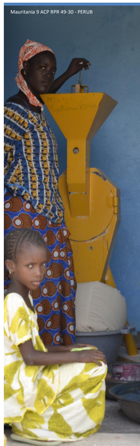
Mauritania 9 ACP RPR 49-30 - PERUB

DG Development and Cooperation EuropeAid