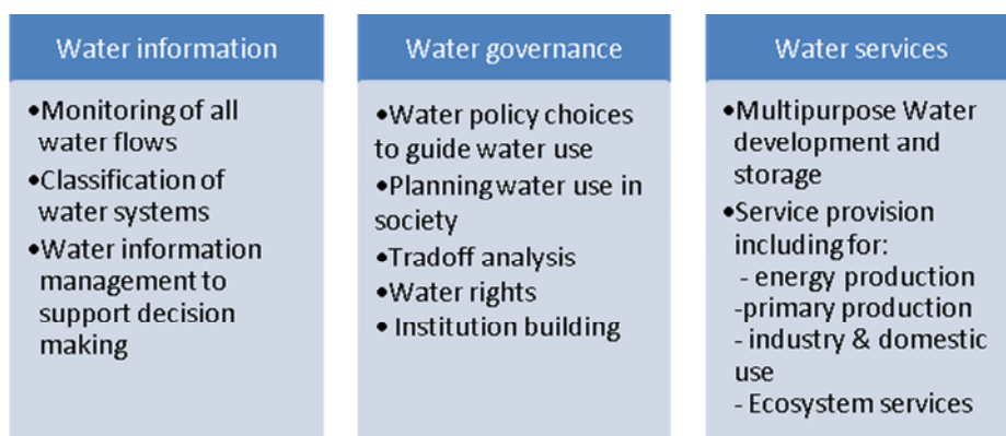
Diagram 2 Water activities in conjunction adding value and generating sustainable goods and services

Diagram 2 outlines a set of key water activities that are necessary to implement in conjunction in order to generate sustainable goods and services to improve development outcomes. Where water crosses international boundaries the chain of activities needs to be put in a transboundary context. TWM and in-country water management is about managing a public good and creating the enabling environment for downstream investment in services of both a public and a private character.