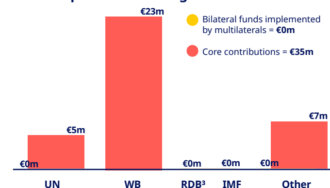
Potential differences between totals and the apparent sum of individual amounts are due to rounding.