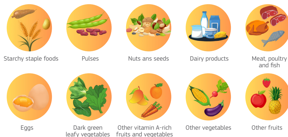
Figure 1. The ten food groups used in the MDD-W indicator, defined according to their nutrient content