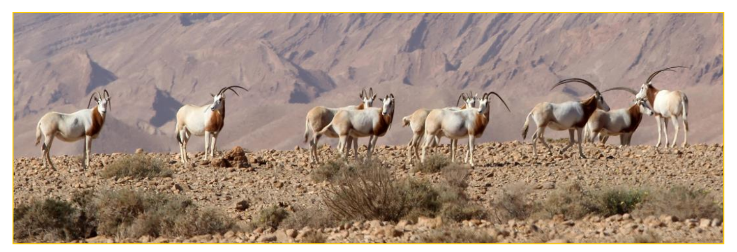
Tunisian biodiversity: scimitar-borned oryx (above); wildflowers, slender-borned gazelle, ostrich and addax