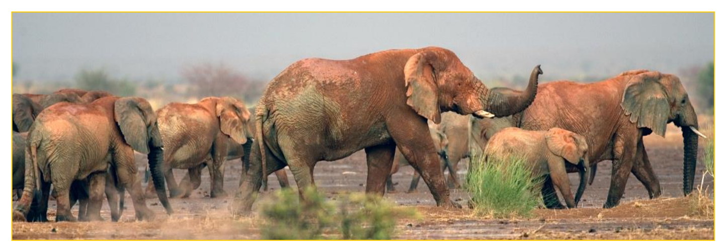
Mali's elephants on the move (above); poached elephant, elephants at Lake Banzena, community meeting (sidebar)