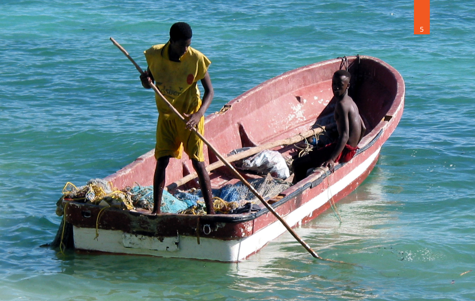
Fishermen in Zanzibar.