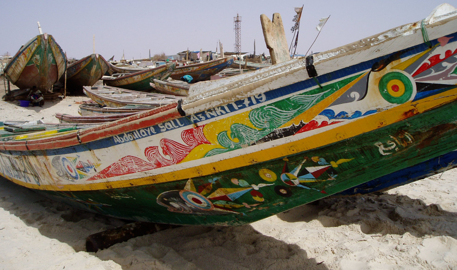
Pirogues, Nouakchott-beach, Mauritania