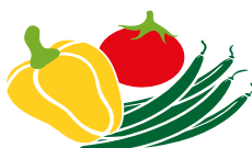
GREEN BEANS 1