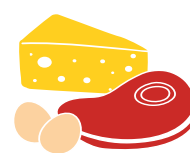
MEAT AND DAIRY 6