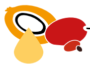
PALM OIL 2