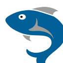
FISHERIES AND AQUACULTURE 8