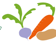
TUBERS & LEGUMES 3