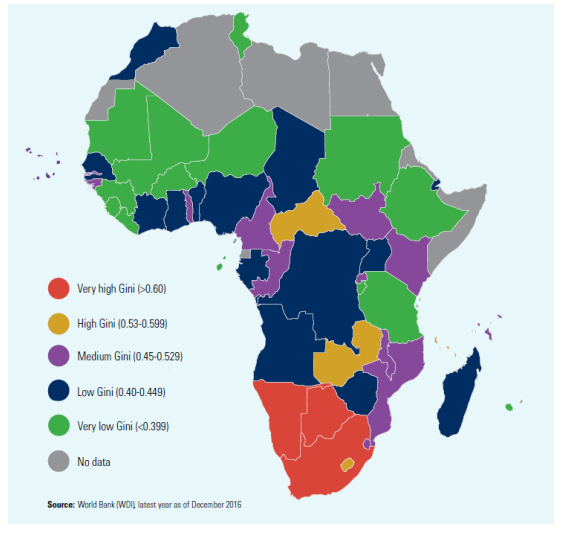
Figure 1. Inequality levels in African countries according to various

With regard to levels of inequality, Odusola et al. (2017) and Chancel et al. (2019), using different indicators for inequality, find a similar picture of the level of inequality in Africa: a concentration of high inequality in Southern Africa, which dwindles towards the Sahara and the north of the continent. The latest update of the WID database estimates that, on average in Africa, the richest decile received 50% of total income, this percentage reaching 65% in South Africa (Robilliard, 2020).