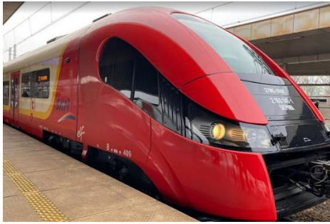
Fast City Rail