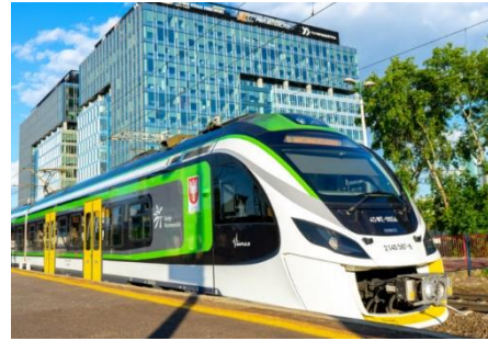
Mazovian Rails train