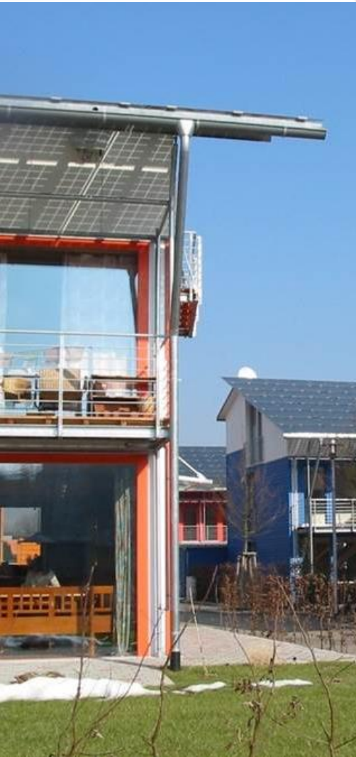
Zero net energy homes