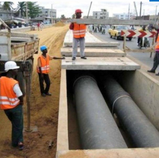
Urban works - Cotonou

→ Need to combine development, CC mitigation and adaptation in a common vision enhancing synergies and reducing negative effects