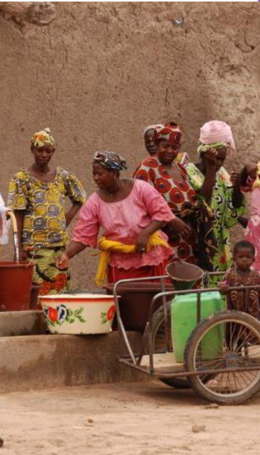
Women collecting water - Mali