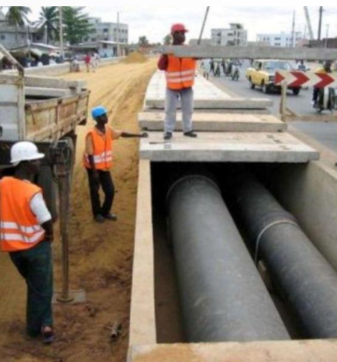
Urban works - Cotonou

ACCESS TO CLEAN ENERGY is as important as adaptation and mitigation! A consistent policy needs to address all together.