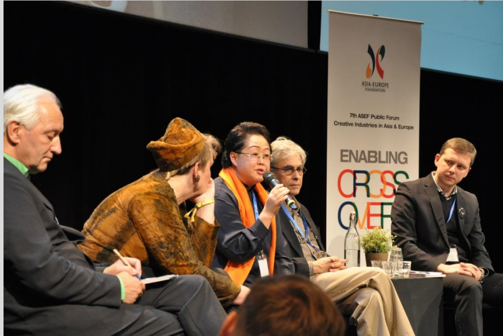
ASEF Experts' Meeting & Public Forum in the framework of the Asia-Europe Culture Ministers' Meeting