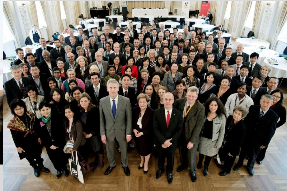
Informal ASEM Seminar on Human Rights