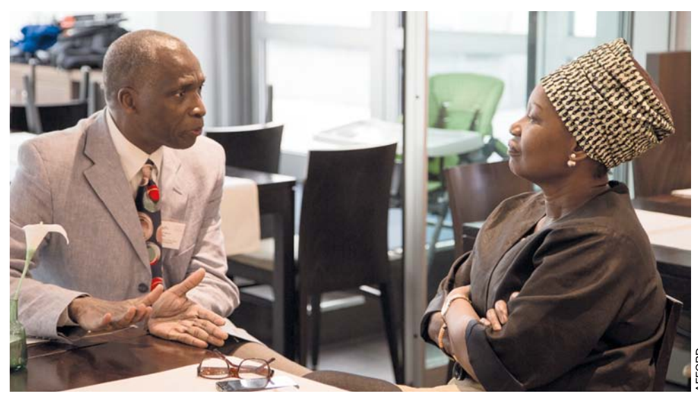
Delegates at the African Diaspora and Development Day 2015 conference, London