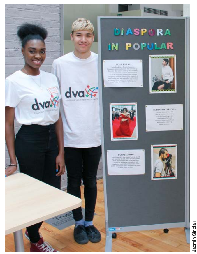
Diaspora Volunteering Alliance Annual Conference 2015, London

According to the No Longer Invisible report, a median of £2,000 is sent home annually by Londonbased Latin Americans. Brazilians send the most at almost 24% of their personal weekly income. They send substantially more than other nationalities, with almost one-third sending more than £5,000 per year. Most of them send money to support their families (60%).