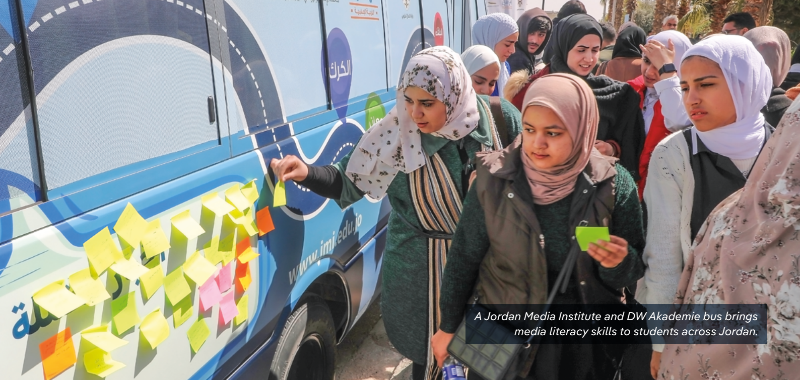
A Jordan Media Institute and DW Akademie bus brings media literacy skills to students across Jordan.