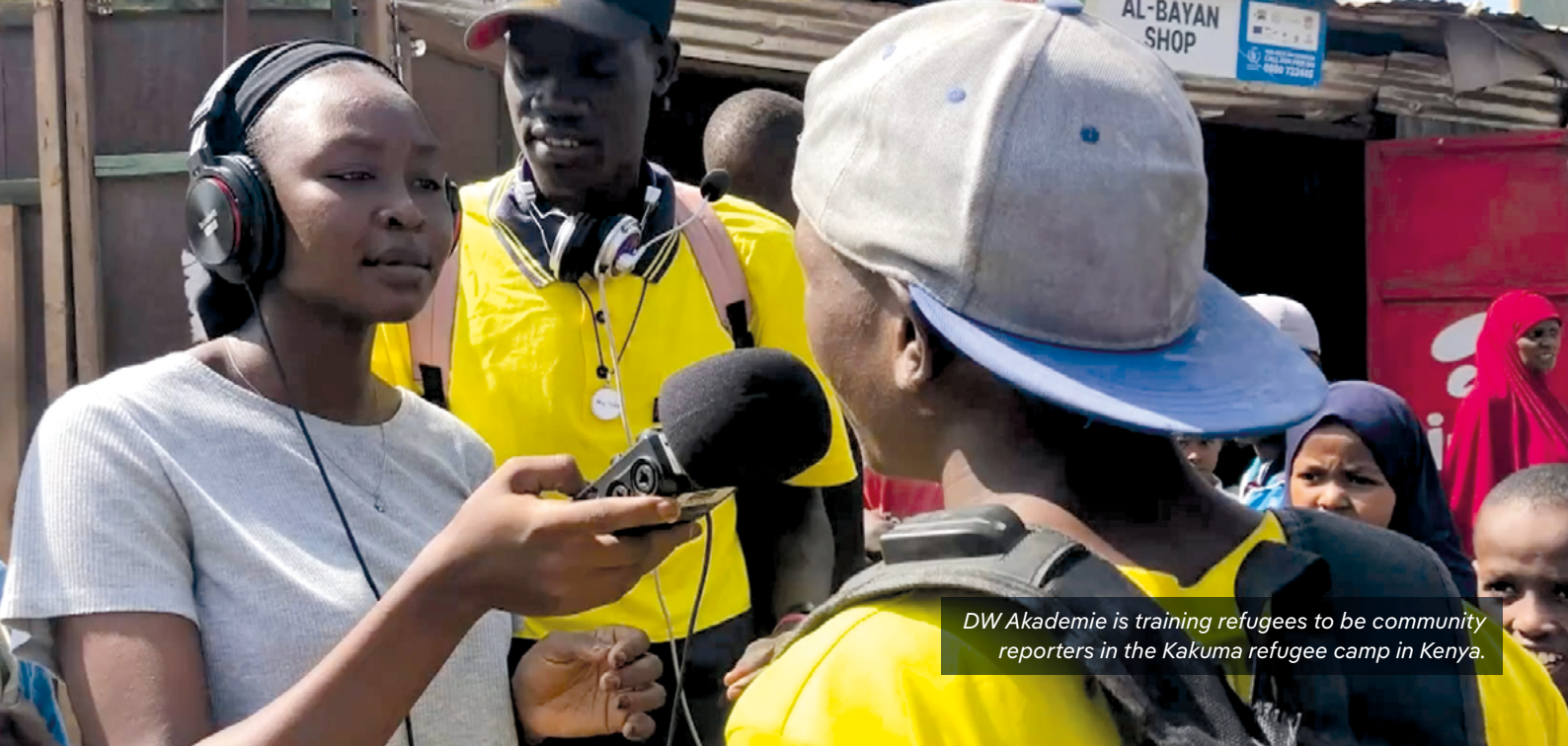
DW Akademie is training refugees to be community reporters in the Kakuma refugee camp in Kenya.