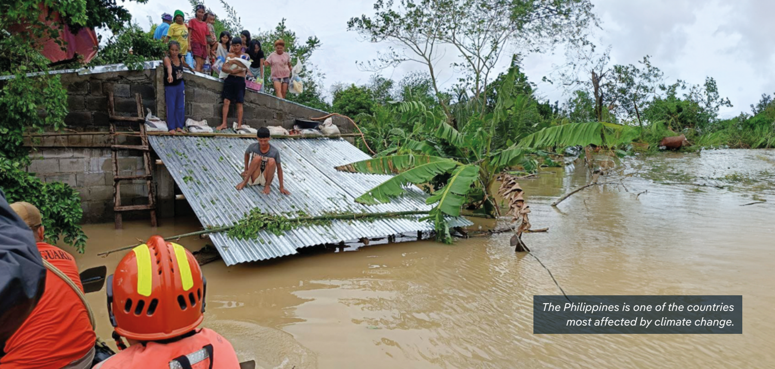
The Philippines is one of the countries most affected by climate change.