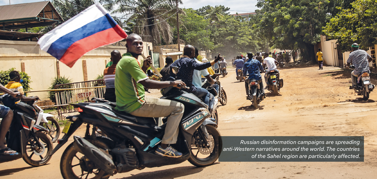
Russian disinformation campaigns are spreading anti-Western narratives around the world. The countries of the Sahel region are particularly affected.