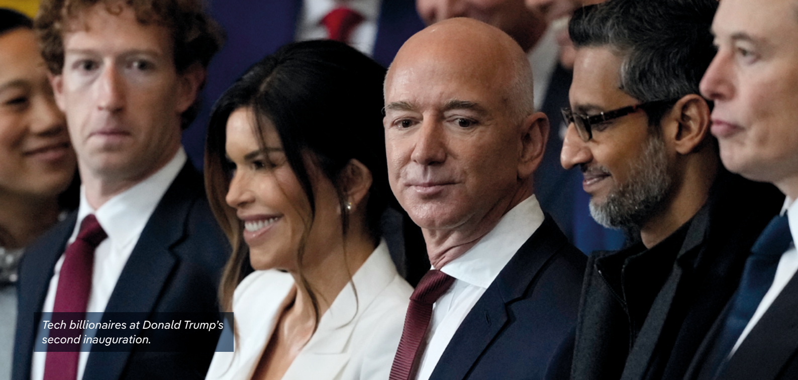
Tech billionaires at Donald Trump's second inauguration.