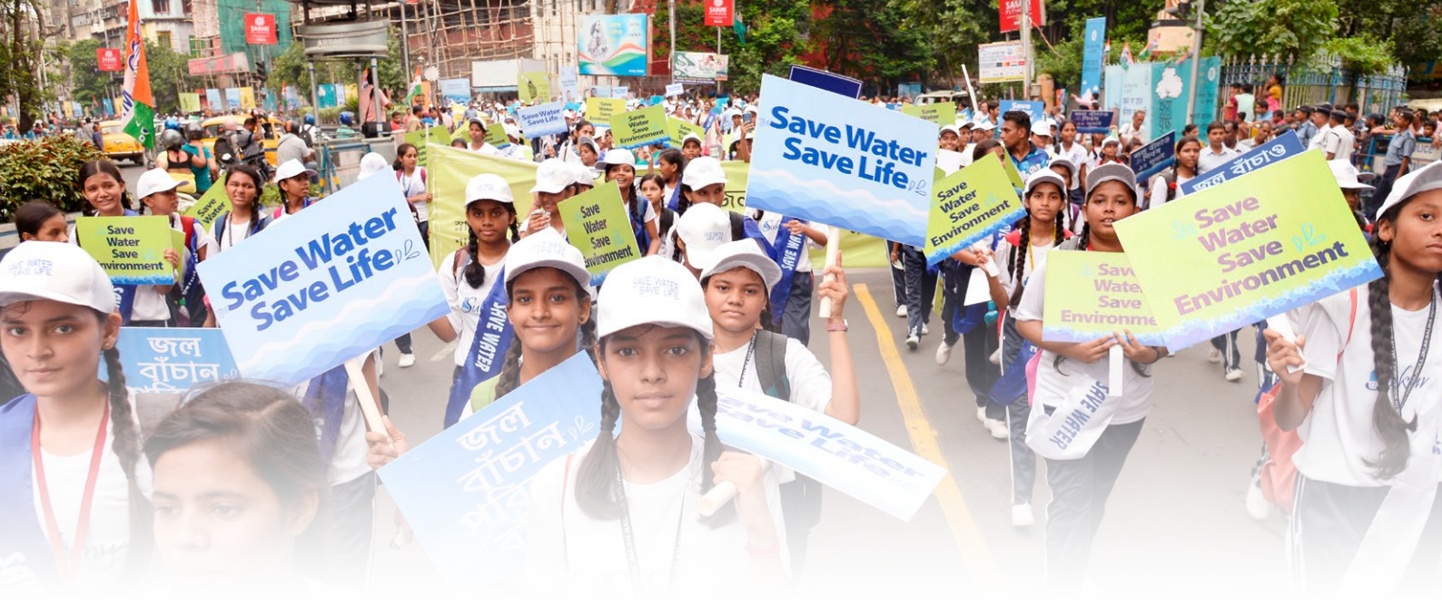
School awareness campaign in Calcutta, India.