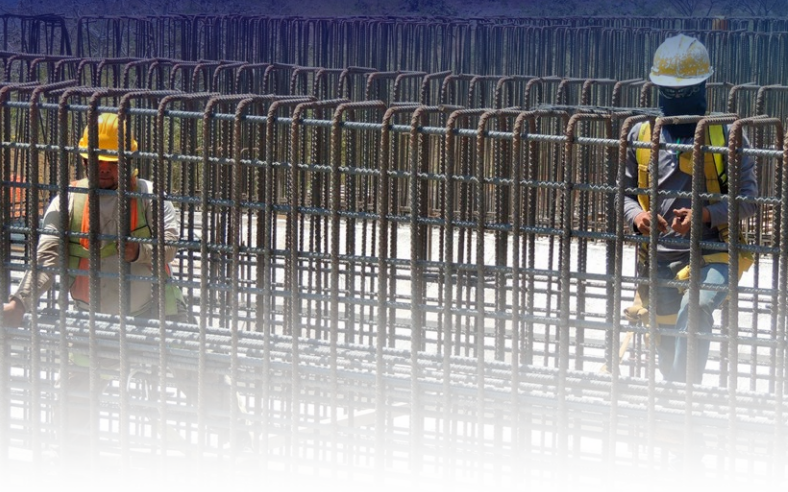
Work progress at waste water treatment plant in Masaya