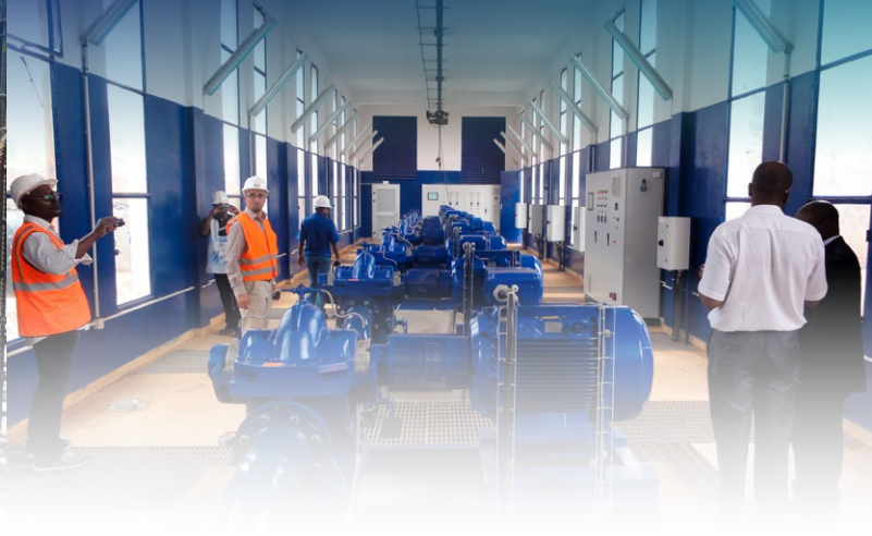
Water supply in Yaoundé – EIB/AFD project