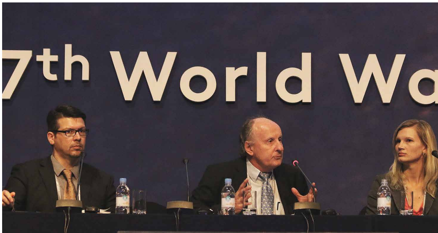
Panel discussion, World Water Forum

The visit of Commissioner Mimica to the WWF marked the EU's engagement with the post-2015 development agenda and sent a clear signal about the importance of having a dedicated goal for water among the Sustainable Development Goals (SDGs).