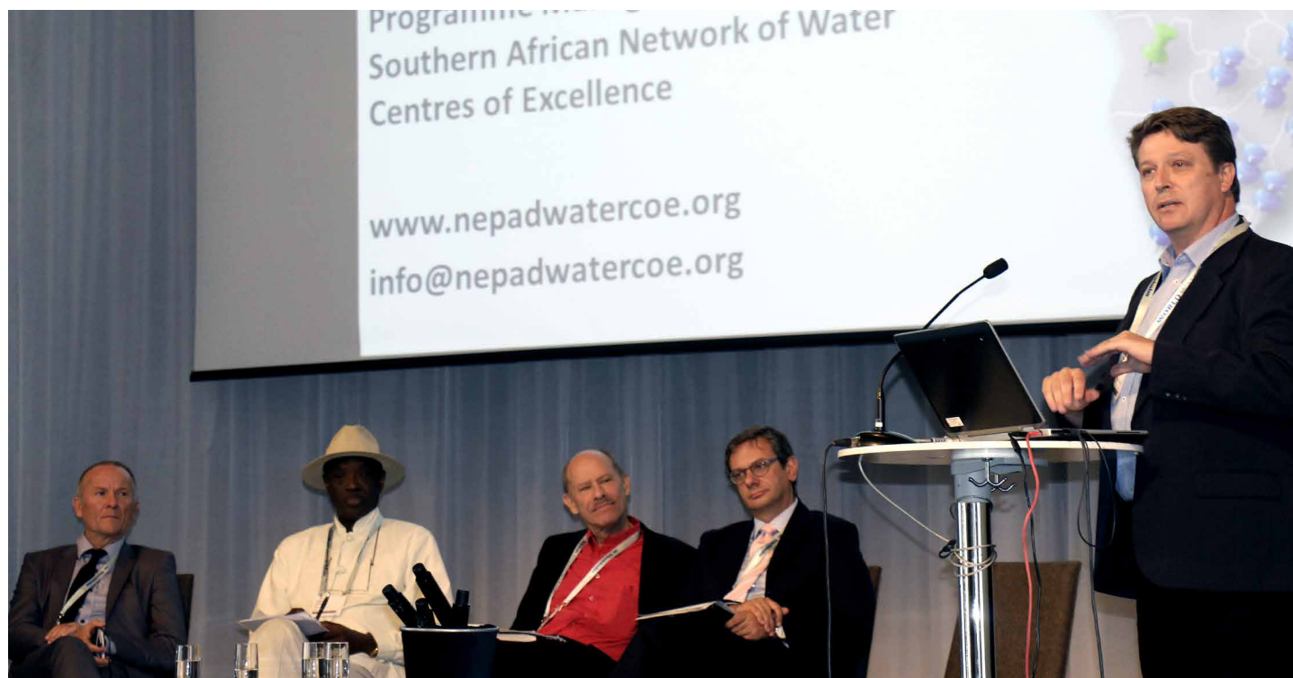
Panel discussion, World Water Week