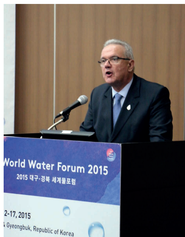
Mr. Neven Mimica at the 7 th World Water Forum