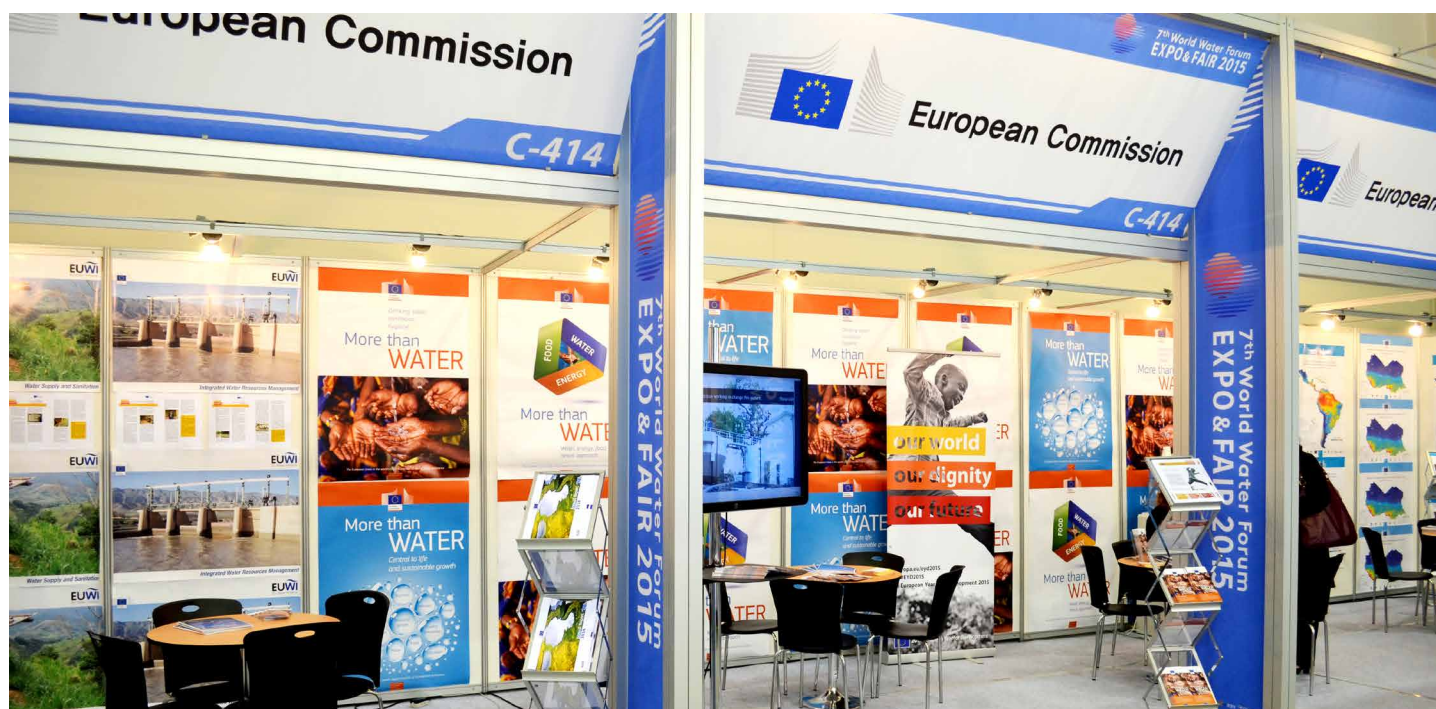
The EC exhibition stand at the World Water Forum

The EU DG Cooperation had an expo stand outside the conference venue in central Stockholm. Most of the stands were located outside and were accessible to the public. The EU distributed the leaflet More than water to inform visitors about the EUWI and the MSF meeting and EC activities, and screened a rolling video of the ACP-EU Water Facility projects.