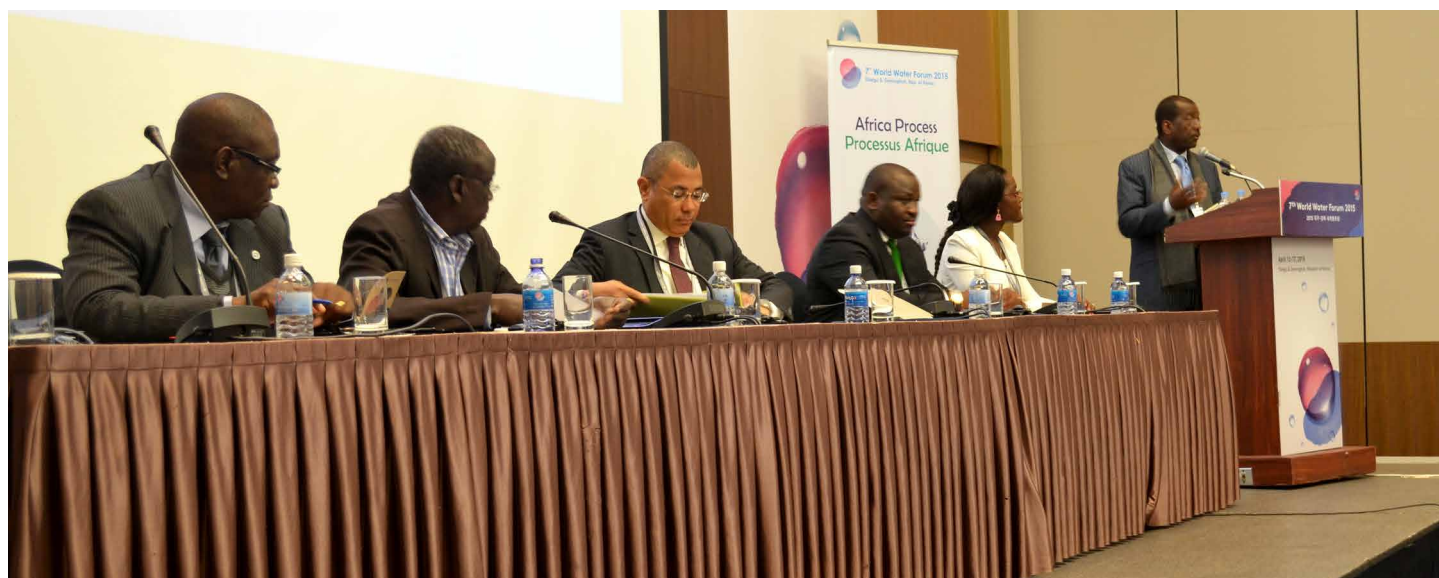
Africa Process at the 7 th World Water Forum