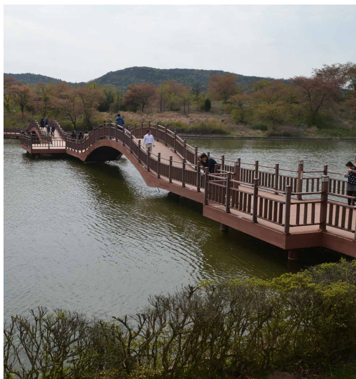
Gyeongbuk, South Korea

The stand displayed EC posters and publications, played a trailer video about 10 WATSAN projects funded under the ACP-EU Water Facility Program, and a popular interactive map displaying EU-supported projects over the last 10 years.