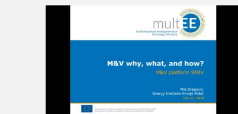
Monitoring and verification practices