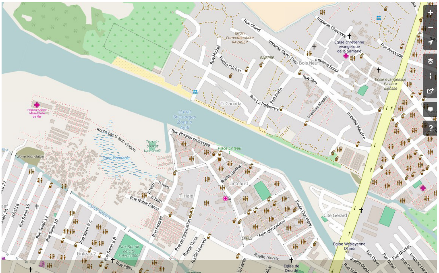
Figure 2 Data available on OpenStreetMap where everyone can access it. Data digitized through OpenStreetMap are by default public. Therefore all geographic data linked to the project (such as building footprints, roads and pathways) are available to everyone and can be viewed, extracted, used and updated freely.