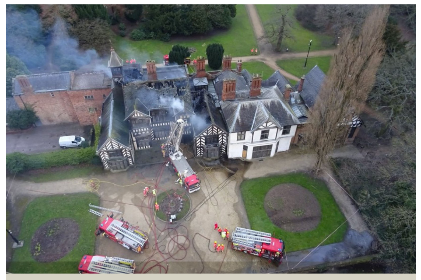
Figure 6 A fire severely damaged a historic building, the Wythenshawe Hall on 15 March 2016.