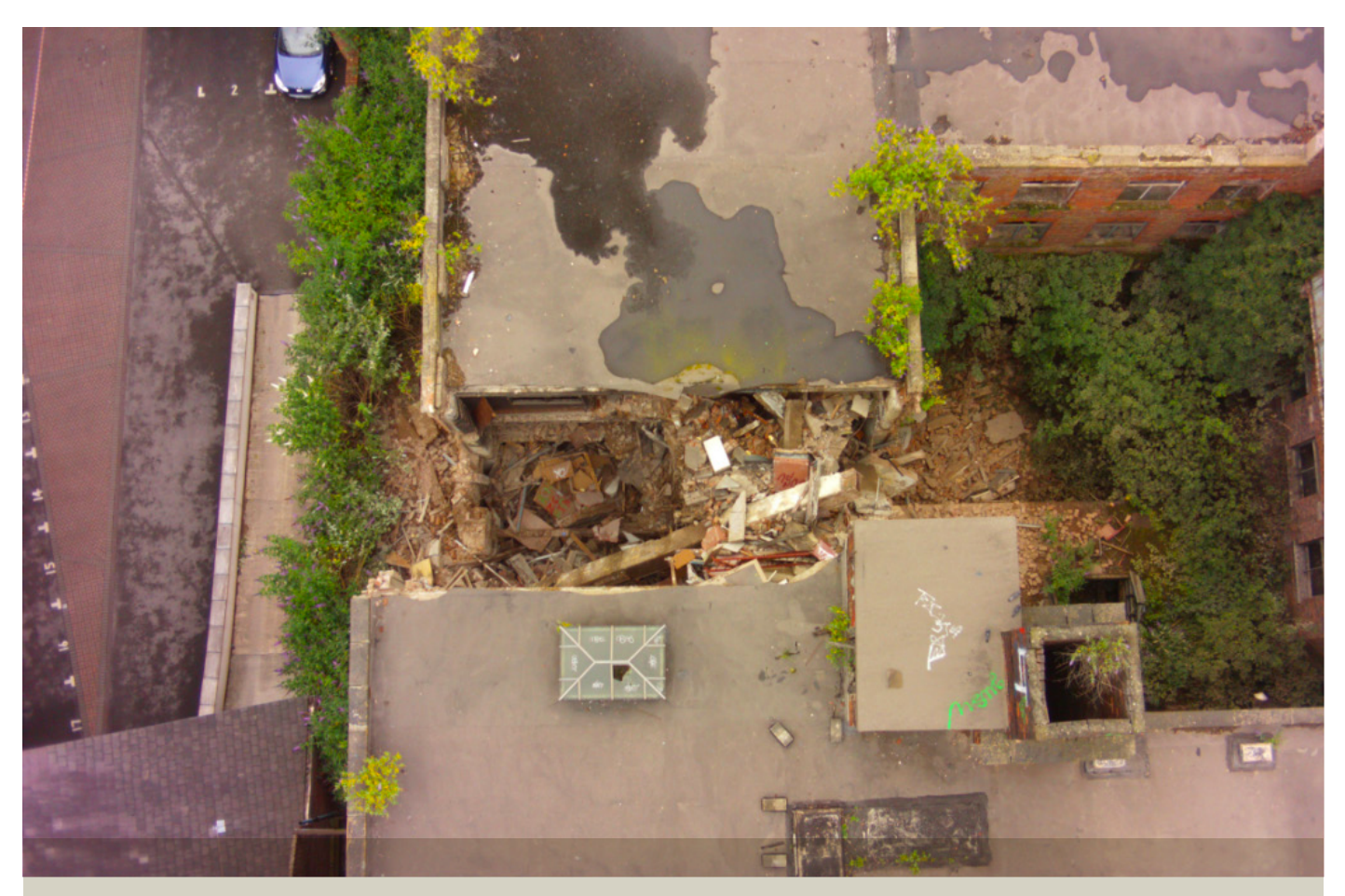
Figure 5 An aerial view of a damaged building can help fire fighters make decisions before entering. GMFRS, November 2015.