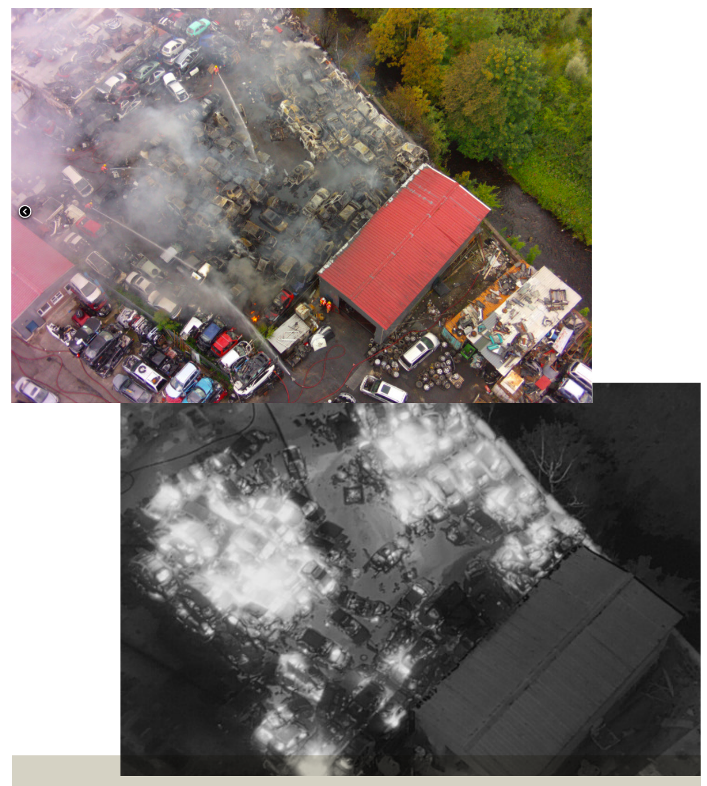
Figure 3 Two images taken by the GMFRS compare a standard definition camera with a night vision camera.