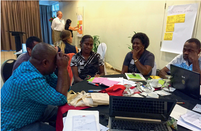
"How to Use the V-Dem Data?", Workshop for Democracy Practitioners, Melanesia, 2015.