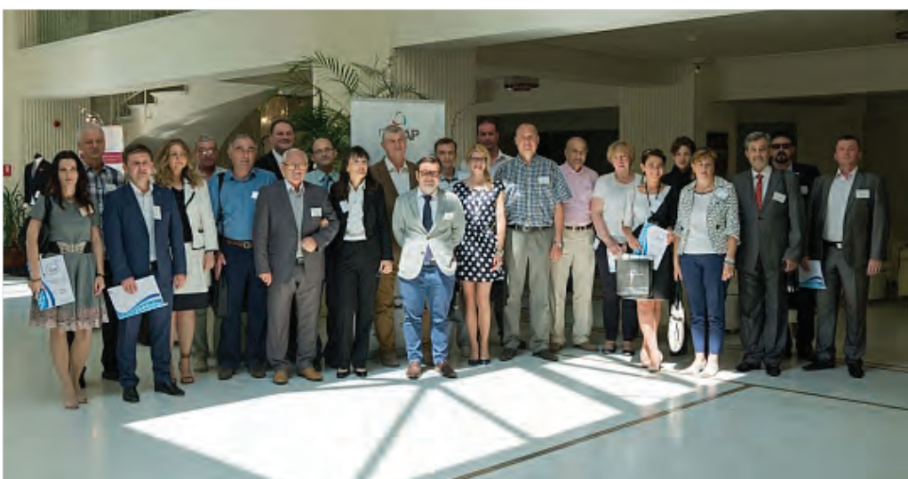
NoGAP Final Conference in Cluj Napoca on 27 July 2016