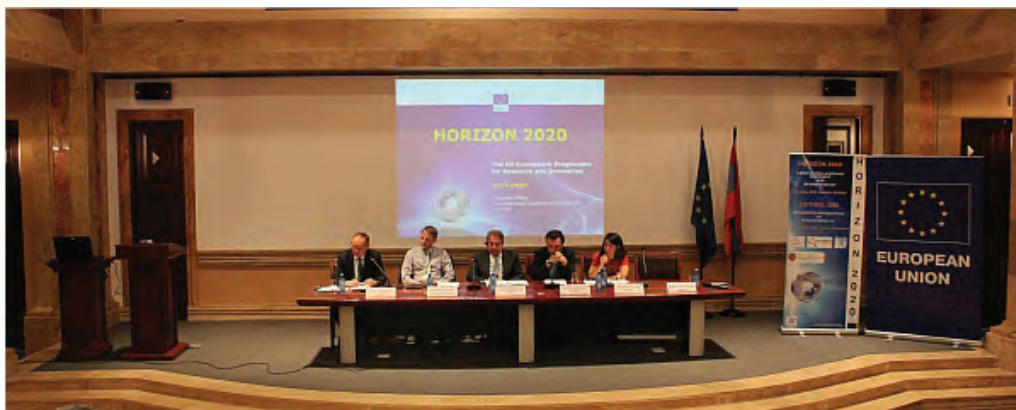
Horizon 2020 Association Events in Armenia

The Horizon 2020 Association Launching Workshop and Information Day devoted to Armenia's association to the European Union Framework Programme on Research and Innovation HORIZON 2020 was held on 2-3 June 2016, at the conference hall of Matenadaran in Yerevan.