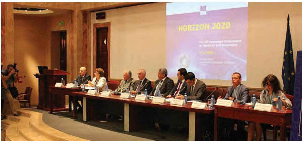
Horizon 2020 Association Events in Armenia

The agenda included a general introduction towards the association to Horizon 2020. The EU4BUSINESS Panel presented various EU initiatives and mechanisms, which will support the SME sector development in Armenia in addition to the Horizon 2020 SME Instrument. Representatives of the EU Delegation to Armenia, Ministry of Economy of Armenia, European Bank of Reconstruction and Development, European Investment Bank and Enterprise Incubator Foundation of Armenia took part in this session.