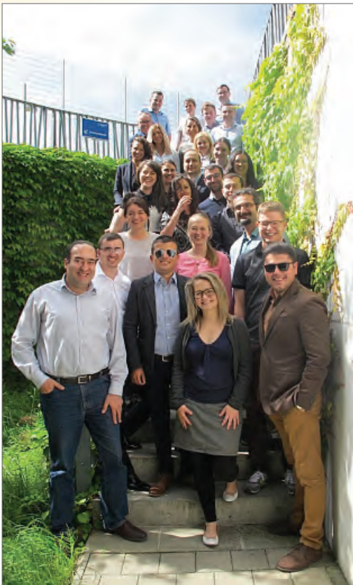
Summer School 2016

The IncoNet EaP Summer School on 'Energy Efficiency: International Project Management – from Theory to Practice' was held between 13-17 June 2016 in Vienna under the co-organisation of ZSI and TUBITAK. 24 participants, with academic, NGO, and private sector backgrounds, attended the summer school. They came from 18 different countries, the majority of them from the Eastern Partnership region.