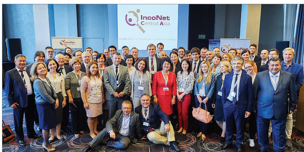
EU-Central Asia PSC on 'Health' in Warsaw 2016

Two recently published brochures sum up the results of the events.