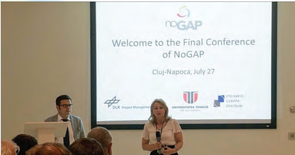
NoGAP Final Conference in Cluj Napoca on 27 July 2016

The NoGAP project (1 September 2013 to 31 August 2016) aimed to reinforce cooperation between the EU and the Eastern Partnership countries to develop a 'common knowledge and innovation space' on 'secure, clean and efficient energy' in order to bridge the gap between research and innovation. NoGAP produced a number of public deliverables , all available from the project's website.