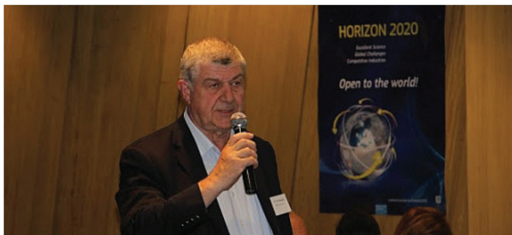
Horizon 2020 Info Day and NCP Workshop in Tbilisi