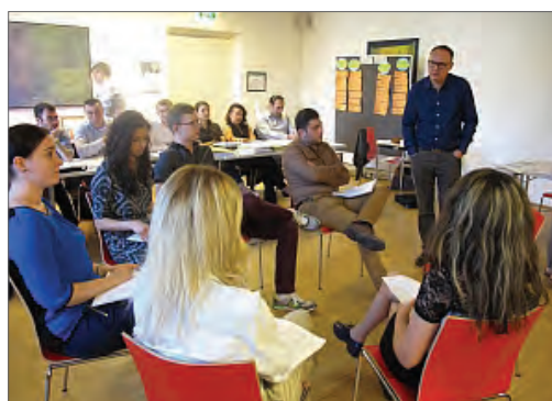
Summer School 2016