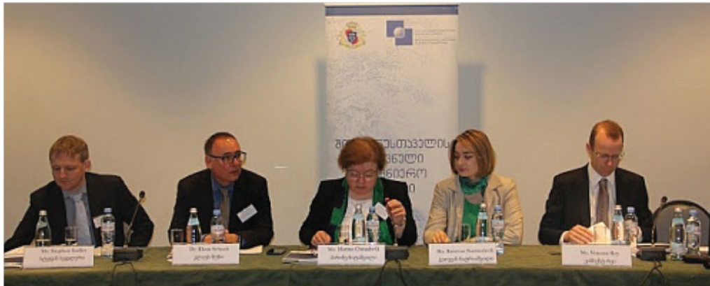
Horizon 2020 Info Day and NCP Workshop in Tbilisi

On 30 May 2016, an EU Research and Innovation Framework Programme Horizon 2020 information day and NCP workshop took place in Tbilisi, Georgia. The event hosted a wide range of participants and speakers from the European Commission, EU Delegation to Georgia, representatives of the Ministry of Education and Science of Georgia, European Investment Bank InnovFin programme, National contact points from Georgia as well as from the Horizon 2020 associated countries. Scientists and innovators from Georgia, representatives of various research institutions, universities and SMEs attended the information day.