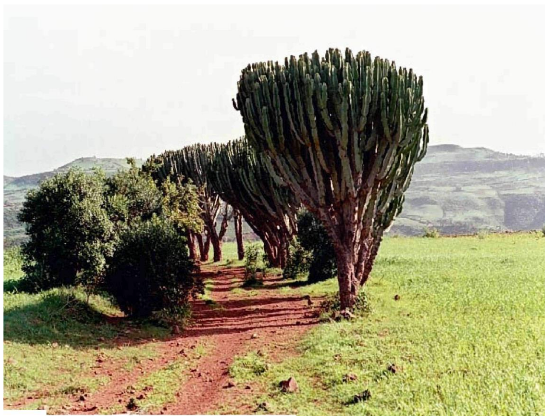
Remnants of an evil eye protection hedge, Shimela Maryam, ANRS.