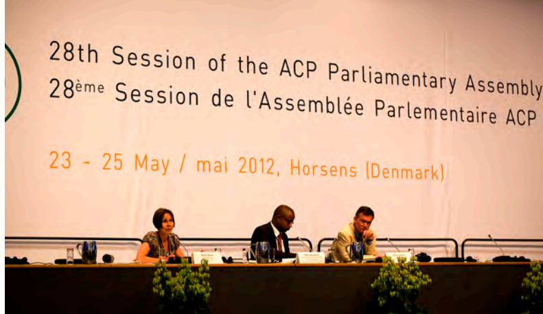
UN Environment – DTU Partnership side event at the 28th Session of the ACP Parliamentary Assembly, May 2012