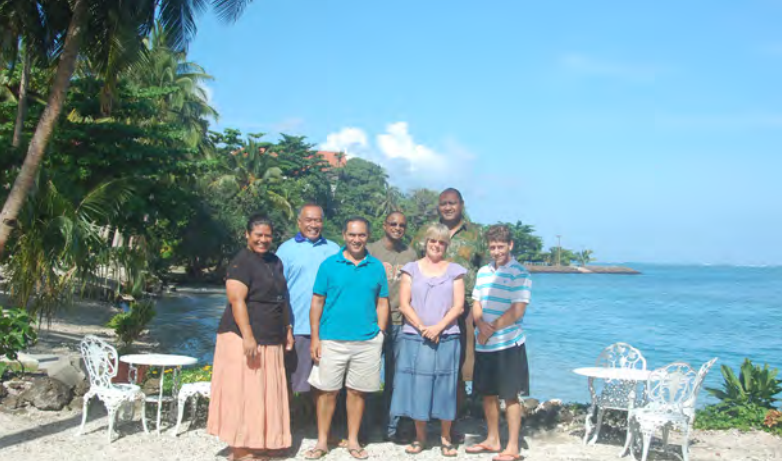
Pacific Hub team retreat, 2012