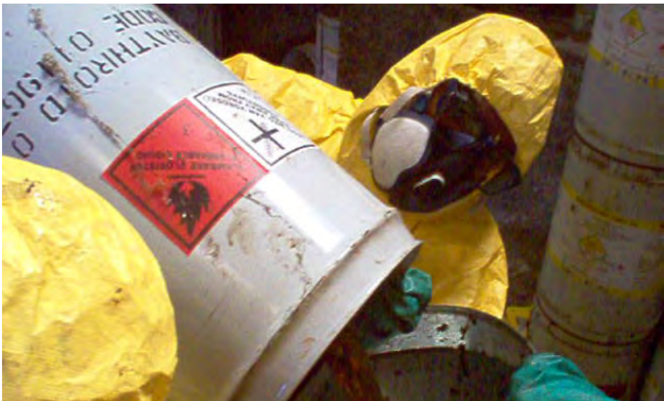
Figure 3. Pesticide safeguarding and disposal operations in West Africa

The project was implemented through engagement with regional and national