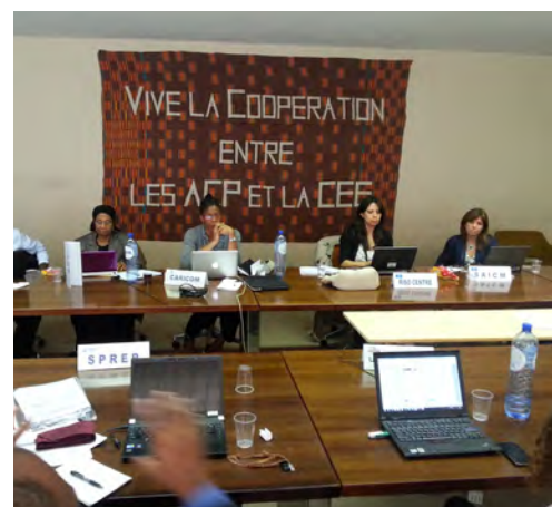
Programme Steering Committee meeting participants at the Secretariat for the ACP Group of States in Brussels, Belgium