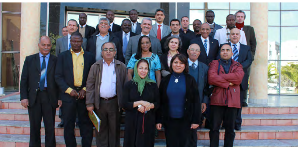
Participants at the UNCCD - Sustainable Land Management event