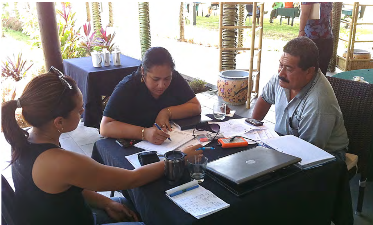
Figure 2. Regional workshop on capacity-building for integrated pest management, Ouagadougou, Burkina Faso, 2012