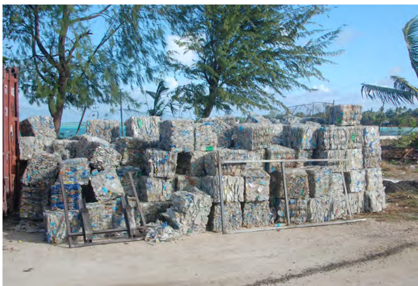
Plastic recycling site, Tarawa, Kiribati