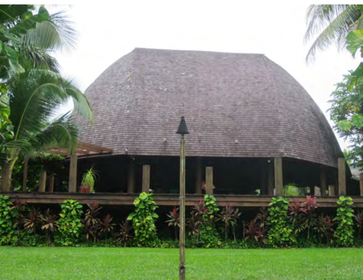
Fale (Samoan house) in Apia, Samoa