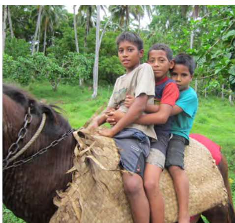
Samoa children, South Coast, Samoa, March 2012