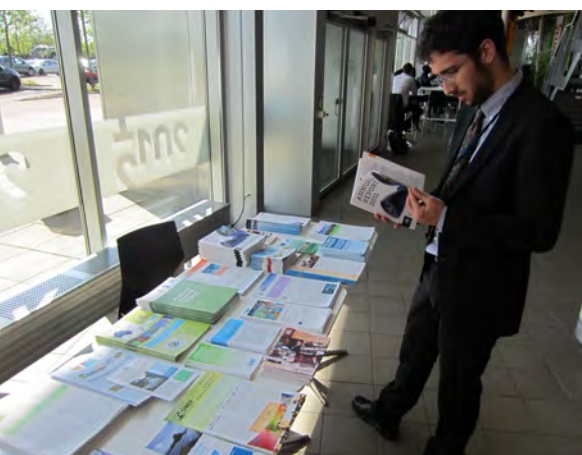
An ACP MEAs stand at the 28th Session of the ACP Parliamentary Assembly, May 2012