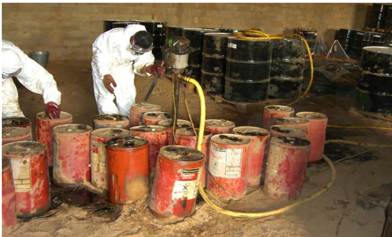
Figure 4. Pesticide safeguarding and disposal operations in West Africa

Working with country teams to develop their skills, the project inventoried obsolete pesticides, empty containers, contaminated equipment and contaminated sites in the majority of participating ACP countries. In Africa, 2,821 tons of obsolete pesticides and 23 priority contaminated sites were identified while in the Caribbean, 231 tons of obsolete pesticides and 12 contaminated sites were identified. In the Pacific, an inventory of persistent organic pollutants (POPs) in Pacific island countries, undertaken in the 1990s by the Australian Agency for International