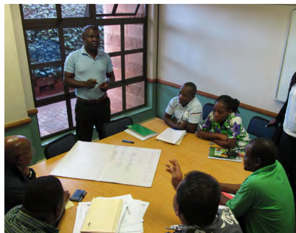
Training of enforcement officers under the Programme