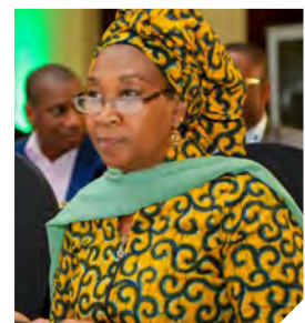
Fatoumata Jallow-Ndoye Anglophone Coordinator, African hub African Union Commission