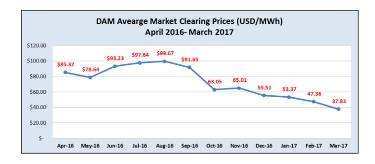
Daily Average MCP prices April 2016 to March 2017.

The monthly average Day Ahead market clearing price (MCP) was slightly lower during the month of March 2017 at 3.783USc/KWh when compared to the 4.736USc/KWh recorded in February 2017. Below is a summary of the daily average MCPs for the month of March 2017.