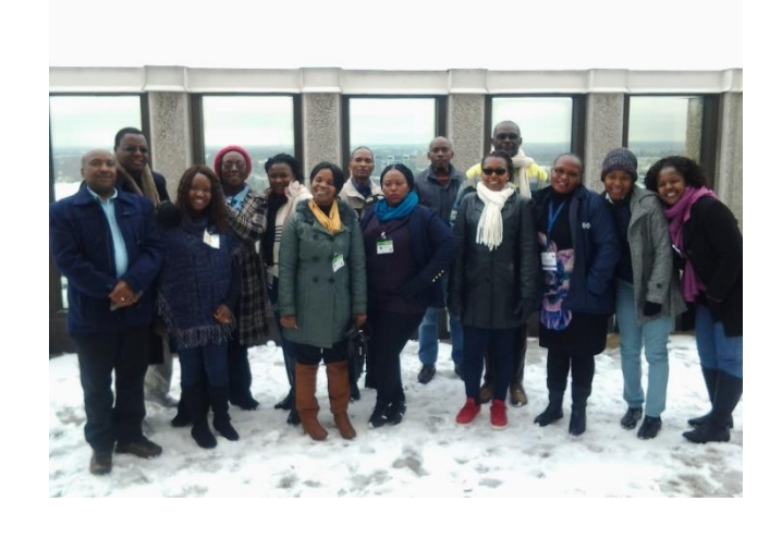
ESC members at Fortum Headquarters during the Exchange visit to Finland

Improvement, Environmental Management around the construction, and operation of Transmission lines and Emissions handling and treatment. The team also managed to embark on visits to Suomenoja Combined Heat and Power Plants, where best practices in Energy Efficiency and CO2 reduction during thermal generation were demponstrated. A visit to Fortum Riihmaki also exposed participants to the most modern ways of waste treatment and Hazardous waste handling. This linked theory to real world practical solution to Environmental Challenges.