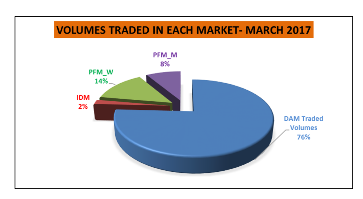
Traded Volumes in MWh in DAM, IDM, FPM-W and FPM-M for the month of March 2017.

Trading in the market was significantly lower during the month of March 2017 when compared to February 2017. Total traded volumes on the Day Ahead market (DAM), intra-day market (IDM), Forward Physical Market Monthly (FPM-M) and Forward Physical Market Weekly (FPM-W) decreased by 9.3% to 74,880 MWh in the month of March 2017, from the February 2017 figure of 82,535.70 MWh. Below is the overview of volumes traded in DAM, IDM, FPM-M and FPM-W for the month of March 2017.