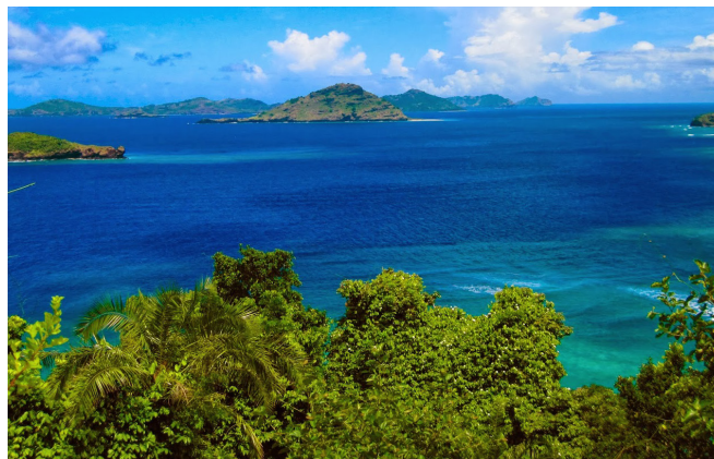
A view of nature’s beauty from Comoros Islands - an ACP country

In the Caribbean, the programme has supported a culture of institutionalizing capacity building for MEAs. In 2015, the Ministers of Environment and Sustainable Development – based on recommendations from beneficiaries – officially requested the CARICOM Secretariat to play a key role in facilitating and coordinating various capacity development initiatives on access and benefit-sharing in the region. Endorsed through a decision at the Meeting of the Council for Trade and Economic Development (COTED) – Environment and Sustainable Development in 2015, this move was emblematic of the institutional strengthening of MEAs support in the region as a result of CARICOM Secretariat’s role in hosting the Caribbean Hub.