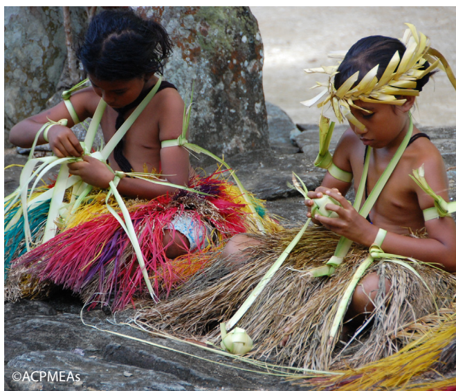
Girls in traditional grass skirts in Yap, Federated States of Micronesia

Fiji and Cook Islands also completed their respective State of Environment Reports. SPREP organized trainings for Pacific Island countries to support negotiations with users of genetic resources under the Nagoya Protocol. For example, access and benefit sharing workshops were held in Nadi and Sydney from August 5-8, 2014 to support Pacific Island Countries’ understanding and potentially becoming Parties to the Nagoya Protocol. Through such support, it is expected that at least four more Pacific ACP countries will soon become party to particular MEAs and benefit from SPREP’s advice on the same.