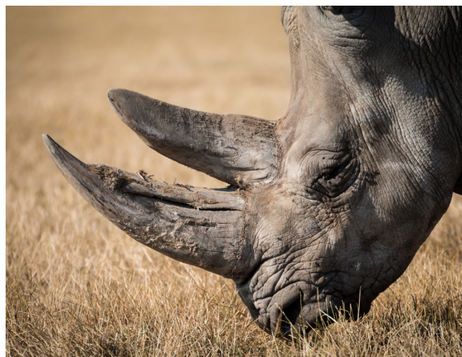
Black rhinoceros grazing - a critically endangered species

One particularly successful outcome was the African Colloquium of Parliamentarians in Entebbe, Uganda in June 2012, which culminated in the creation of the network of African Parliamentarians known as the Green Birds Africa to promote environmental sound management through legislative and national channels. This momentum was carried forward with greater participation of parliamentarians and stakeholders at the Parliamentarian Colloquium held in Addis Ababa in 2014. The outcome came in the form of a declaration by the Parliamentarians and important recommendations addressed to institutions including the African Union Commission, UN Environment, and member states. The Declaration included a commitment by the Parliamentarians to engage in MEAs implementation and environmental sustainability issues in their countries.