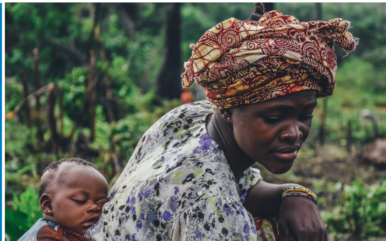
A mother working in a cassava field in Sierra Leone

In the past nine years, the programme has built a culture of institutionalizing MEAs at the regional and national level by enhancing capacities of regional institutions, national bodies, and most fundamentally, empowering the change makers of the field.