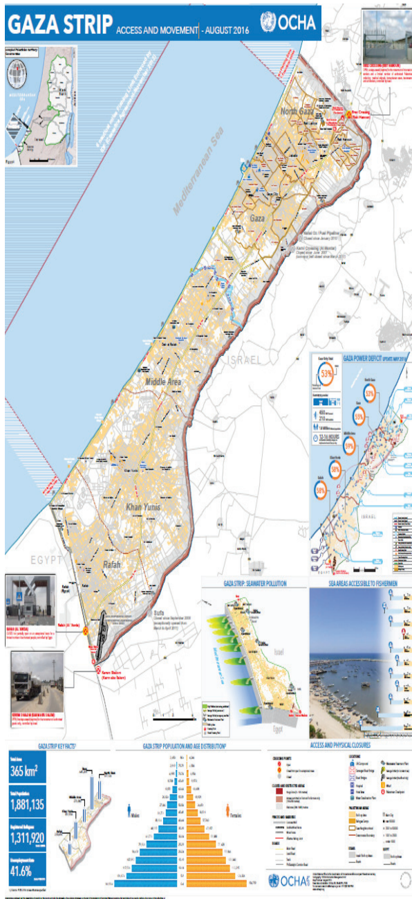
Map 2: Gaza Strip Access and Movement