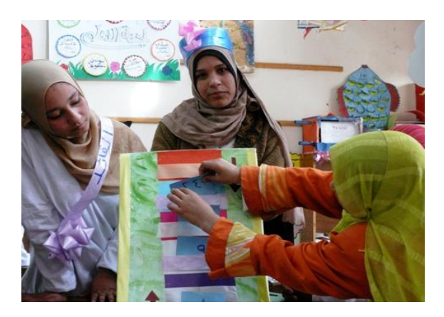
A girl friendly school in the south of Egypt

One father in a village in Upper Egypt decided to donate a piece of land that he owns to build a school for girls in his village. He said that the reason he did that was the feeling of guilt that he carried to that day for not having allowed his daughter to go to school. In tears, the man admitted that his daughter was too old to attend school, but he did not want other girls in the village to miss out on schooling.