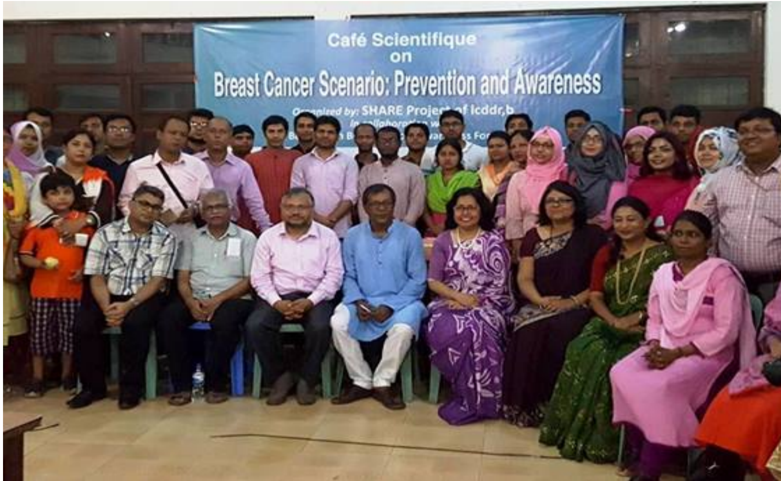
Total two 'Cafe Scientifique' organized on NCDs