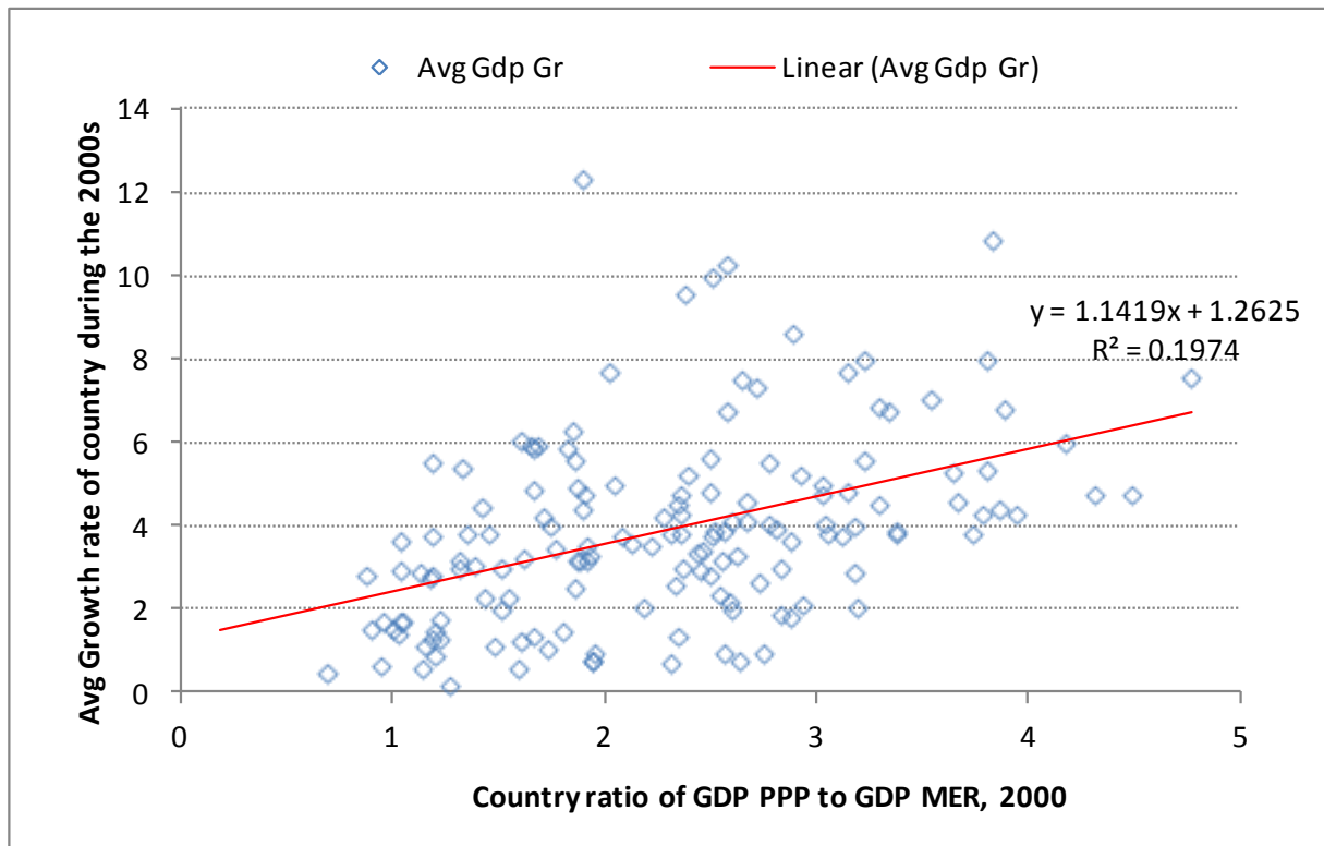
Chart 3: Gdp Ppp/Gdp Mer as Predictor of Growth