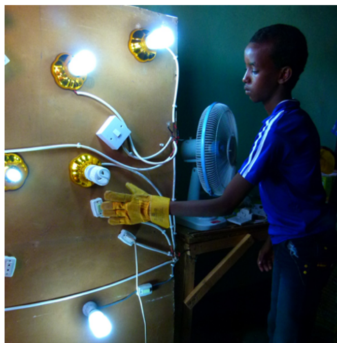
Connecting the dots of the informal economy

Finally, the digitalization of the RNSF research volumes allows to make them available on DEVCO Academy where all the research materials will be available for further dissemination to DEVCO staff, EU Delegations, and other stakeholders.