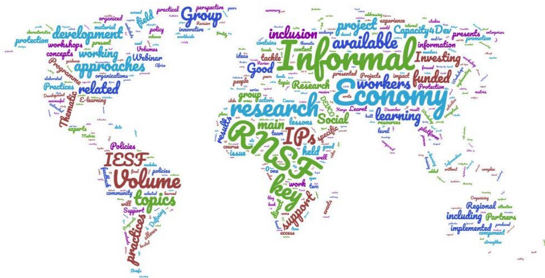
RNSF informal world

Published by the EC-funded RNSF project based on the EU "Investing in People" Programme