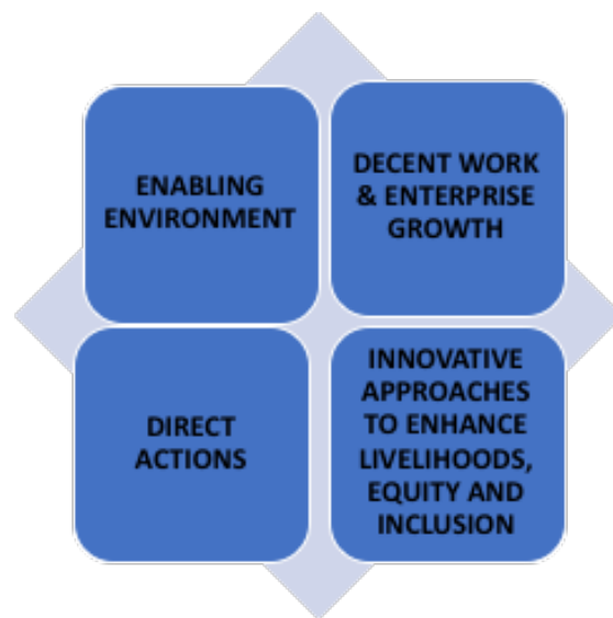
RNSF Research Areas

Volume 2, Defining the Informal Economy, is dedicated to significant and practical definitions of the Informal Economy and its dimensions and phenomenology. It presents the most recent overview of key concepts related to the Informal Economy as long with the most available statistical figures for more than 90 countries.