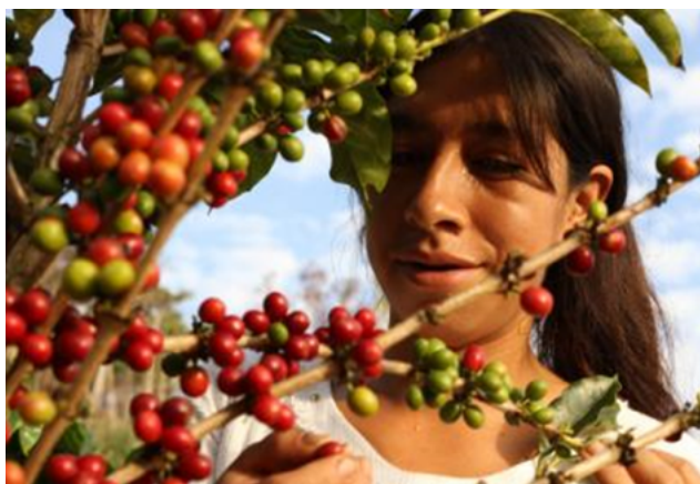
The different faces of the the informal economy

For any request related to the RNSF project starting from January 2019, please contact A.R.S. Progetti at: s.bove@arsprogetti.com